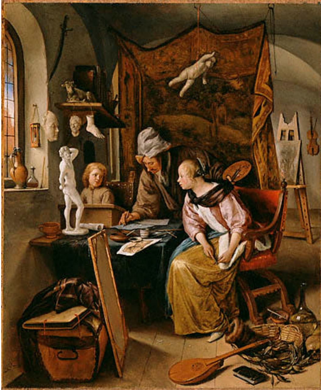
Drawing Lesson , 1665