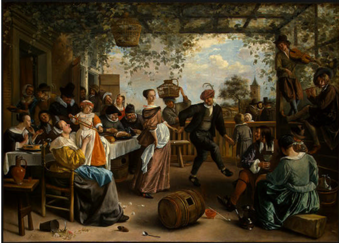
The Dancing Couple, 1663