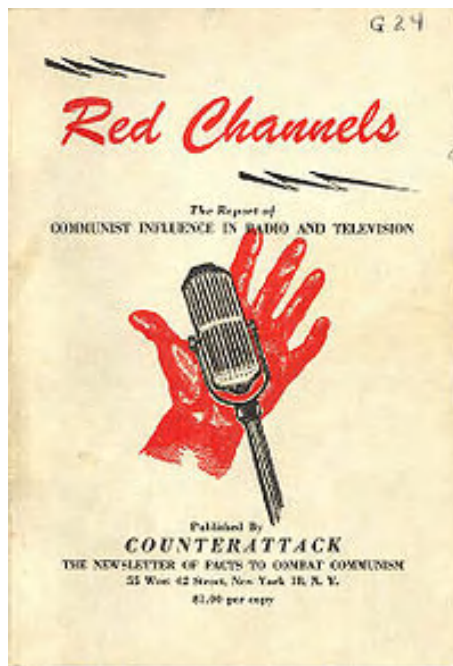
Fig. 3-1 Image of cover of Red Channels , a pamphlet-style book issued by the journal Counterattack in 1950

Political pressure increased significantly on Hollywood to prove that it was truly anti-Communist. It worked. On November 17, 1947, the Screen Actors Guild passed a vote that required its officers sign a non-Communist pledge. On November 25, 1947, the House of Representatives passed a vote to issue citations against the ten entertainers who refused to answer questions, now known as the “Hollywood Ten.” The next day, the MPAA president released a statement saying the ten would not be employed until they cleared themselves of the contempt charges and signed sworn statements that they were not Communists. This was officially the first Hollywood blacklist.