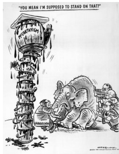
Fig. 3-2 Editorial cartoonist Herbert Block created the term “McCarthyism” in this cartoon which was printed in the Washington Post on March 29, 1950

A political cartoonist for the Washington Post, Herbert Block, coined the term “McCarthyism”. The cartoon appeared in the paper on March 29, 1950. Its original intention was to mock McCarthy and his beliefs. Unfortunately, it only seemed to further McCarthy’s cause and unite those who believed in him. McCarthyism had a loyal base of supporters such as the American Legion.