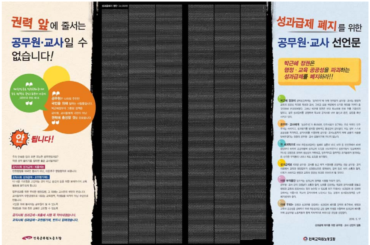
Figure 3. KTU & KGEU, Newspaper Advertisement (KTU & KGEU, 2016b)

Recently, the KTFA, which had earlier shown a more moderate attitude toward performance-based bonuses, has begun to oppose them strongly. The KFTA launched a petition campaign to solve 10 educational problems, with the abolishment of differential performance payments as the first item, in October of 2016. The petition paper, signed by 201,072 teachers (about half of the nation’s teachers) was delivered to the MOE. At the same time, the KFTA announced plans to submit the petition to the National Assembly as a petition for legislation (KFTA, 2016c).