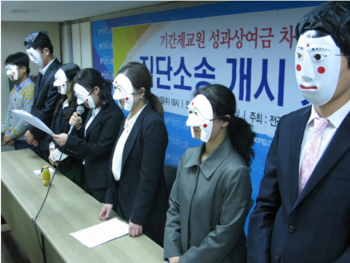
Figure 2. Fixed-term Teachers in the Press Conference (Choi, 2012)

Due to the temporary status of the job, fixed-term teachers not only are discriminated against, but also are threatened with employment termination when they resist the governmental policy. To avoid the difficulties of revealing their identities in public, fixed-term teachers who attended the press conference wore traditional Korean masks (Figure 2). They needed to replace their identity as a teacher with anonymity to survive as a teacher.