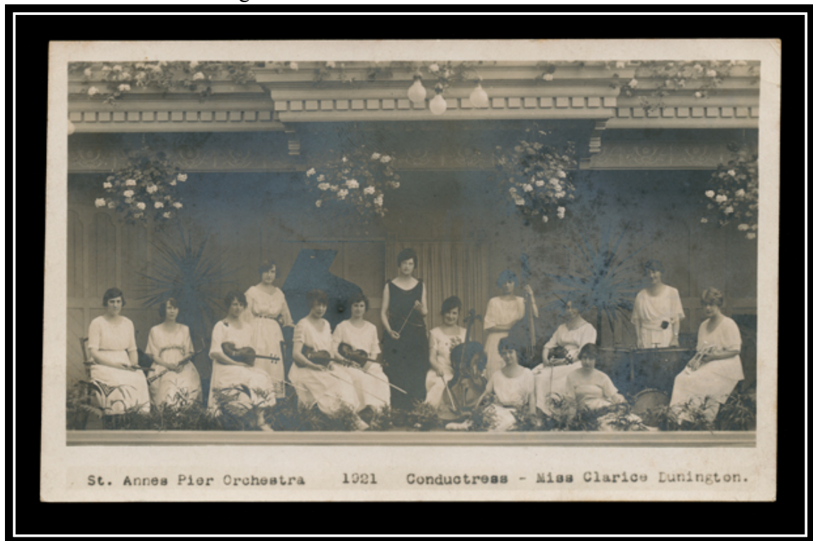
Figure 16. St. Anne's Pier Orchestra 1921