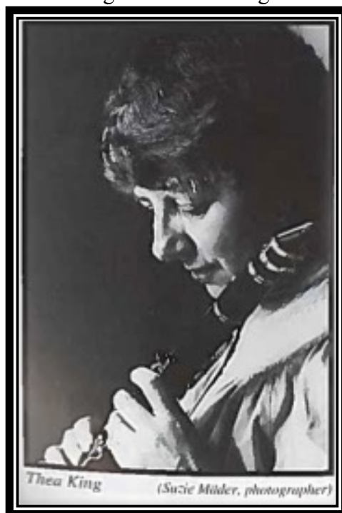
Figure 3. Thea King