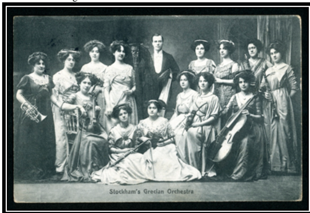
Figure 15. Stockham's Grecian Orchestra 1913