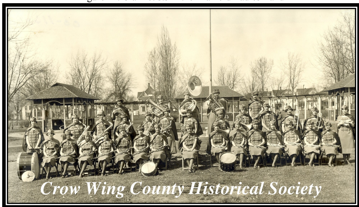
Figure 11. Clarinetists in the Brainerd Ladies Band