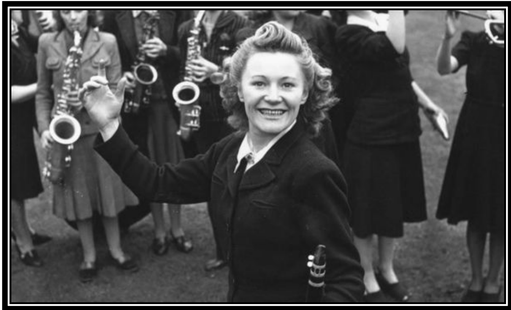
Figure 12. Ivy Benson with her clarinet, leading the band in 1954