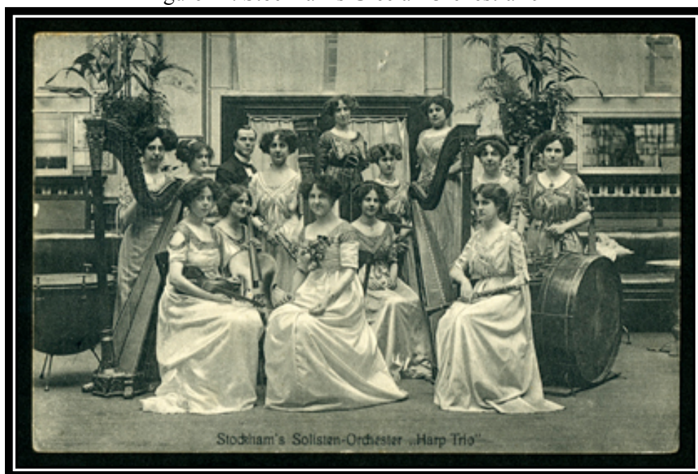
Figure 14. Stockham's Grecian Orchestra 1911