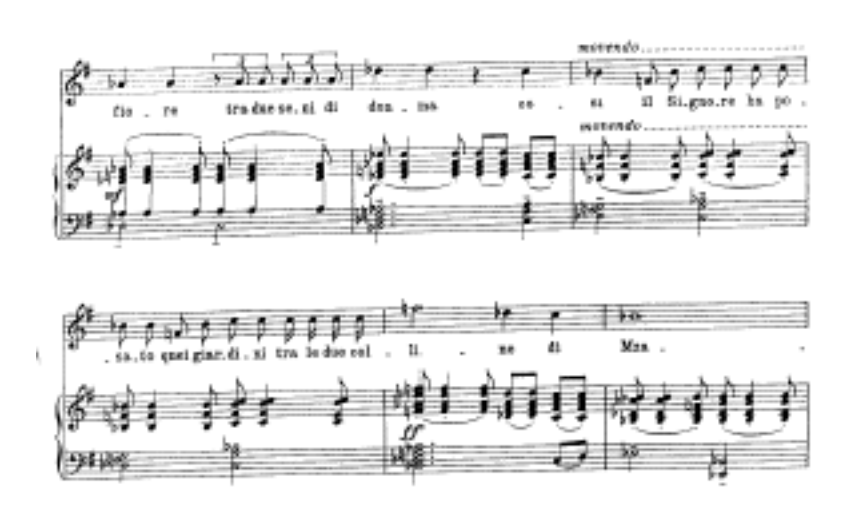
FIGURE 2.51: "I giardini di Ualàta," measures 17-18.

The second is a syncopated element that reappears at the end of each section, as seen in Figure 2.51: