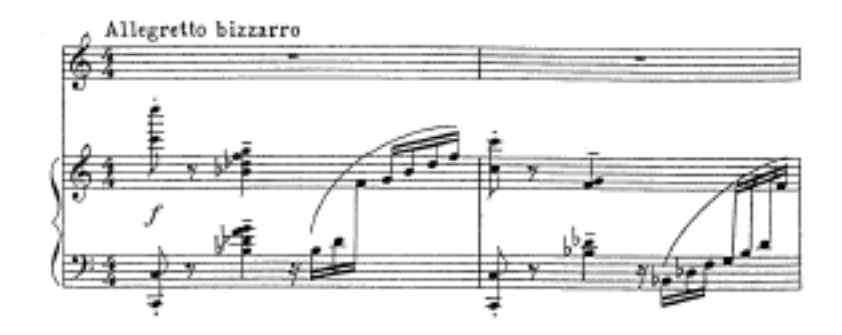
MUSIC EXAMPLE 2.28: Tre poesie persiane, "II," measures 1-2.

After this opening motive, the verses differ slightly in accompaniment. They begin with the opening motive, followed by a florid pattern, and conclude with a series of chords.