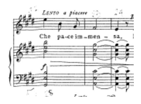
FIGURE 2.6: "Alba di luna bosco," measures 22-24.

This second selection of I canti della sera evokes images of the moon rising above a pond with water shimmering in the moonlight. This shimmering is echoed in the mezzo piano (medium soft) triplet figure in the piano. Measures 22-24, "che pace immensa," are the most unique measures in the song, with a secco-recitative quality. These measures also have the most dynamic intensity, marked with forte (loud).