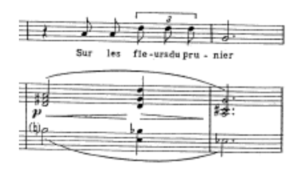
FIGURE 2.43: Petits poëmes [sic] japonais, "III," measures 5-6.