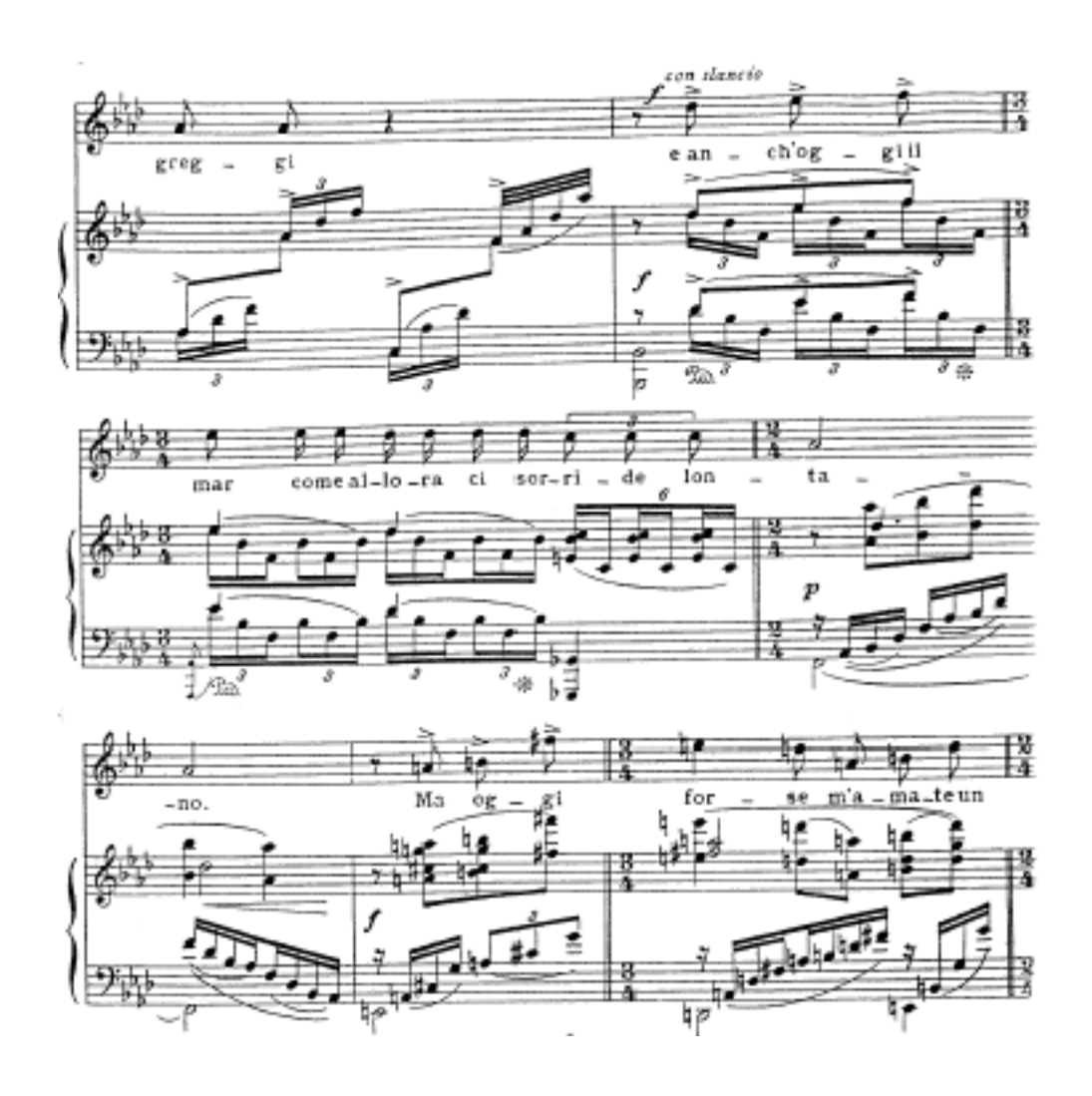
FIGURE 2.13: "L'incontro," measure 62-68, "...e anch'oggi il mar come allora ci sorride lontano."