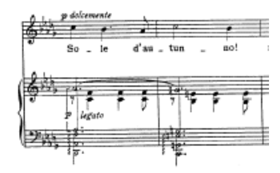
FIGURE 2.22: "Sole d'autunno," measures 5-6.

Secondly, there is a recurring sighing motive that appears throughout the song in both the vocal part and the accompaniment. Its element, as is initially presented, is always descending. The sighing motive, coupled with the earlier syncopated element, reinforces the languid quality of this final song.