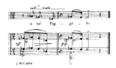
FIGURE 2.33: Antica stampa italiana , measures 28-29 (final cadence in mixolydian mode.)