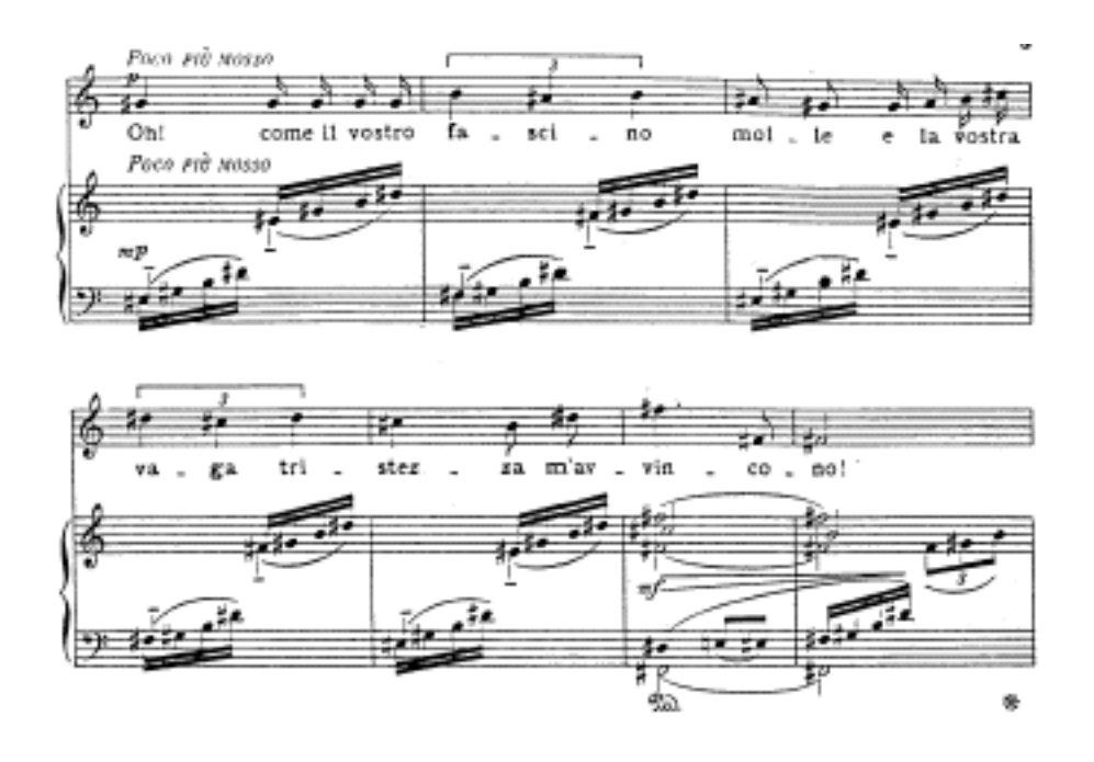
FIGURE 2.14: "Un'ora di sole," measures 27-33.

With a tempo marking of andantino (a little walking)in "Un'ora di sole" approximately 70 beats to the quarter note is implied.