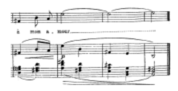
FIGURE 2.37: Una lirica giapponese , measures 62-64.

Santoliquido indicates that Una lirica Giapponaise should be performed andantino misterioso (at a walking tempo and mysterious), although one should be cautioned against too slow of a tempo. A quarter note equaling approximately 75 gives the performers the ability to make rubato while still allowing the song to maintain it's andantino quality.