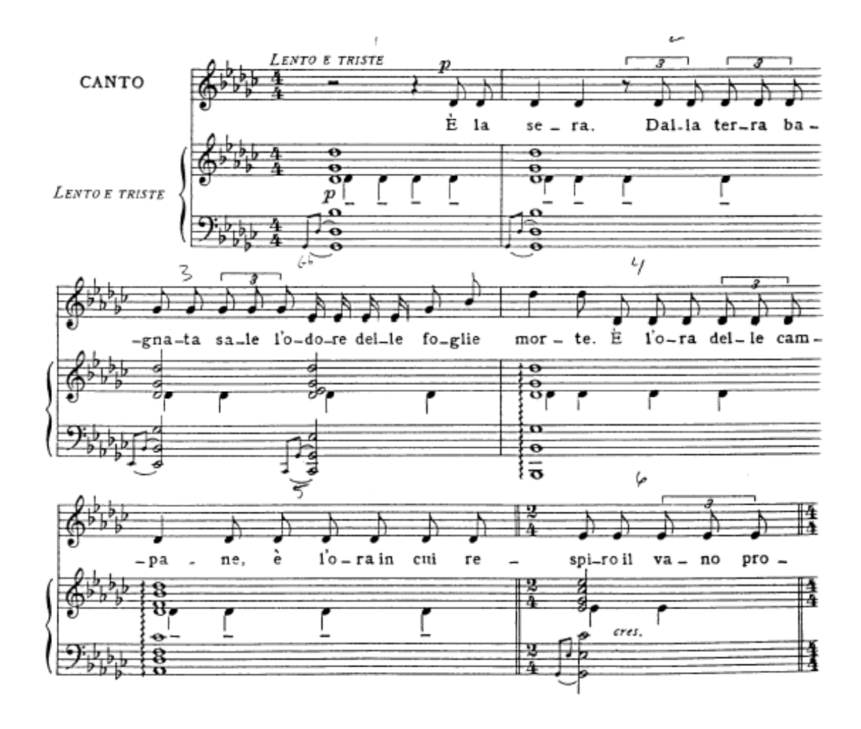
FIGURE 2.7: "Tristezza crepuscolare," measures 1-6.

Measures 17-28, or the B section, are in 6/8 time and have a markedly different texture, with a constant sixteenth-note accompaniment in the right hand of the piano. With the text "Piangete, piangete campane della sera," it can be assumed that the accompaniment at the B section is meant to indicate the ringing, or pealing, of the bells in the text.