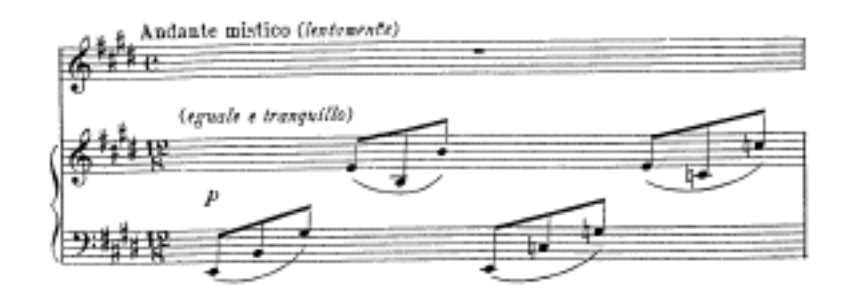
FIGURE 2.29: Tre poesie persiane, "III," measure1.