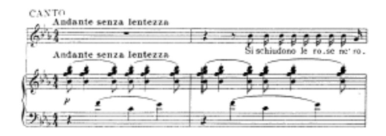
FIGURE 2.44: Supremo sonno, measures 1-2.

The motivic element that unifies this song is syncopation formed by an eighth note followed by a quarter and another eighth, all of which are indicated as staccato.