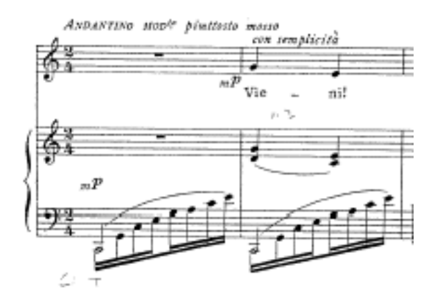
Figure 2.1: "L'assiolo canta," measures 1-2.

The tempo marking of andantino modesto piuttosto mosso (going with movement rather modest) seems to imply a tempo marking of quarter note equaling 66 to 68. The vocal line of "L'assiolo canta" is reflective of the natural inflection of the spoken text. Throughout the song, there are moments of arioso-like writing interspersed with recitative-like passages. The arioso passages are clearly delineated by their broken chordal sixteenth-note accompaniment.