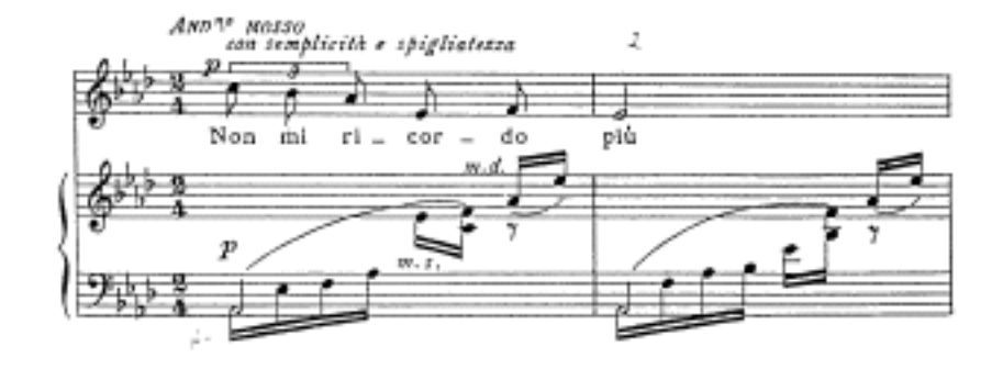
FIGURE 2.9: "L'incontro," measures 1-2.

Secondly, measures 16-20 and periodically throughout the remainder of the song, there is a return to the triplet motive from "Alba di luna sul bosco."