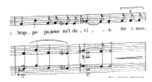
FIGURE 2.34: Antica stampa italiana, measures 7-8. Recurring motive.