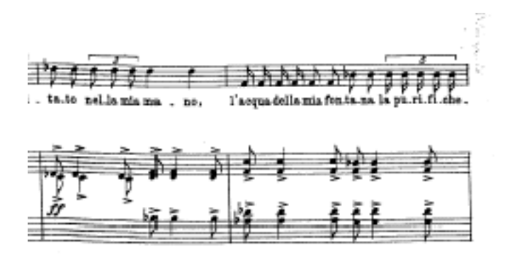
FIGURE 2.53: "Il cuore sanguinante," measures 21-22.

The second, beginning in measure 21, is the same pattern syncopated pattern that appeared in Supremo sonno , (eighth note, quarter note, eighth note), only this time, with a marcato marking.