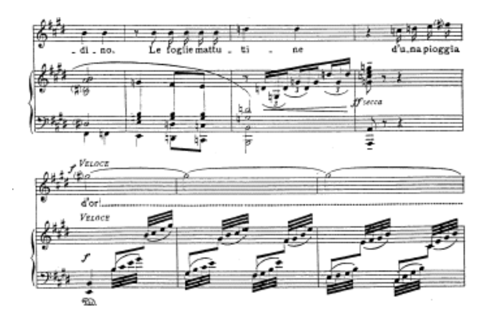
FIGURE 2.17: "Riflessi," measures 67-75.

With the tempo indication of mosso e gaio (moving and gay), it is suggested that the song should be performed at approximately 120 beats to the quarter note. Strict attention should be paid to the composer's changing indications throughout the song. The thirty-second note accompaniment in the piano should be played in such a way as to reflect the glistening of the sun.