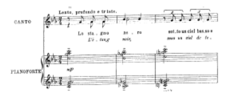
FIGURE 2.31: Il poema della morte, measures 1-4.

Written almost entirely with a chordal accompaniment, the song is primarily in Santoliquido's recitative-like style.