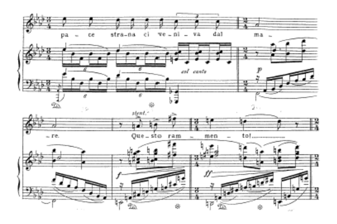
FIGURE 2.11: "L'incontro," measures 22-26.

"L'incontro" has the tempo marking of andantino mosso con semplicità e spigliatezza (andantino mosso with simplicity and ease), and a comfortable pace for this is 62-64 beats for the quarter note. The meter constantly changes, depending on the length of the phrase of text, between 2/4, 3/4, and 4/4.