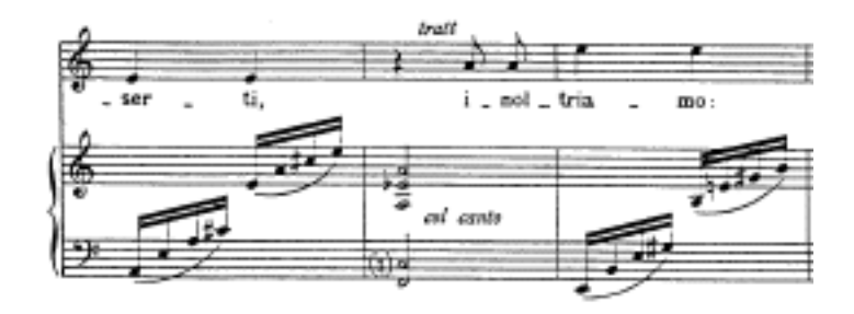
FIGURE 2.19: "Nel giardino," measures 16-18.