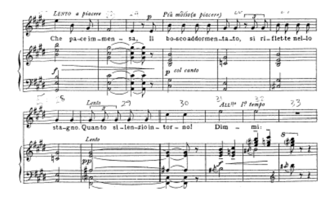
FIGURE 2.4: "Alba di luna bosco," measures 22-33.

The triplet accompaniment returns at the end of the song, measures 35-38, as a way of unifying the song.