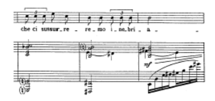
FIGURE 2.20: "Nel giardino," measures 29-31.

At no other point in the song does Santoliquido describe the action of the lovers better than in measures 39-42, or the a' section. The text of the song is exactly illustrated in the piano accompaniment with dolce (sweet) chordal figures.