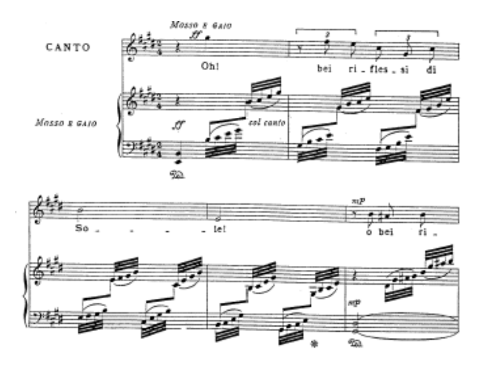
FIGURE 2.15: "Riflessi," measures 1-4.

The second half of A, in which the poem mentions stars, sparks and fireflies, shows the interval of a major second eighth note figure on the second beat of each measure. This pattern, highlighted in staccato, illustrates these sparkling qualities. After this small passage, the thirty-second notes return through measure 49.