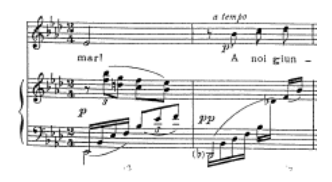
FIGURE 2.10: "L'incontro," measures 16-17.

Secondly, measures 16-20 and periodically throughout the remainder of the song, there is a return to the triplet motive from "Alba di luna sul bosco."