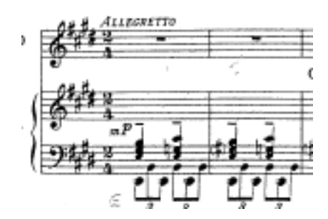
FIGURE 2.3: "Alba di luna bosco," measures 1-2.