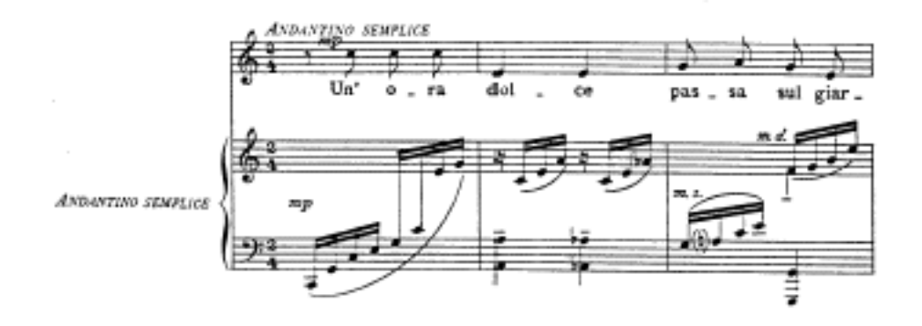
FIGURE 2.18: "Nel giardino," measures 1-4.

Rhythmically, "Nel giardino" is unified by a sixteenth note accompaniment of ascending chords, or arpeggi, which is meant to create a tender quality, or ease.