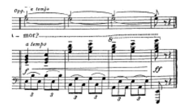
FIGURE 2.5: "Alba di luna bosco," measures 35-38.

This second selection of I canti della sera evokes images of the moon rising above a pond with water shimmering in the moonlight. This shimmering is echoed in the mezzo piano (medium soft) triplet figure in the piano. Measures 22-24, "che pace immensa," are the most unique measures in the song, with a secco-recitative quality. These measures also have the most dynamic intensity, marked with forte (loud).