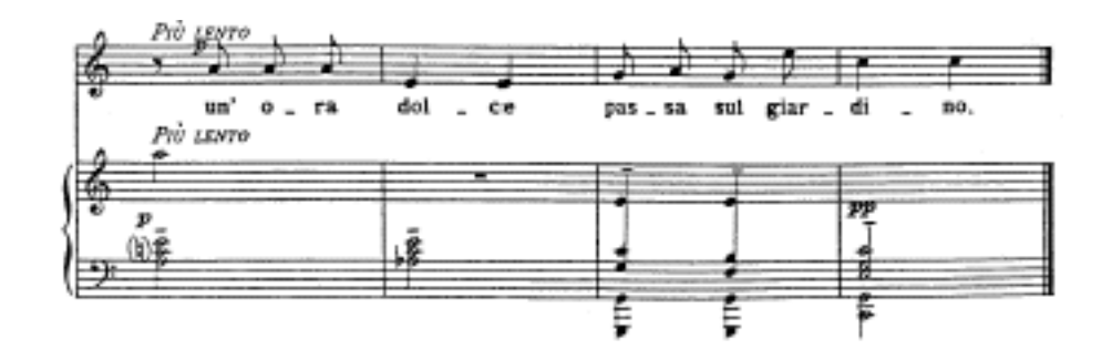
FIGURE 2.21: "Nel giardino," measures 39-42.

Santoliquido indicates that the song should be performed semplice (simply), implying easiness in the tempo. With the tempo equaling approximately 70 to the quarter note, this song has the simplicity that the composer intended. The più vivo (more lively) indicated in measure 21 should continue through measure 38, not slowing until the più lento (more slowly) indication in measure 39.