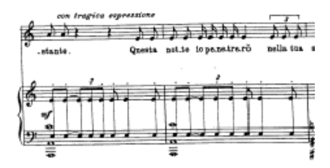
FIGURE 2.52: "Il cuore sanguinante," measures 10-11.

Two motivic elements unify the song. The first, coming in measure 10, is a staccato motive that underlies the nervousness of the text "Questa notte io penetrerò nella sua stanza rischiarato dal mio pugnale. Ed all'alba io getteròil tuo cuore ai corvi!"