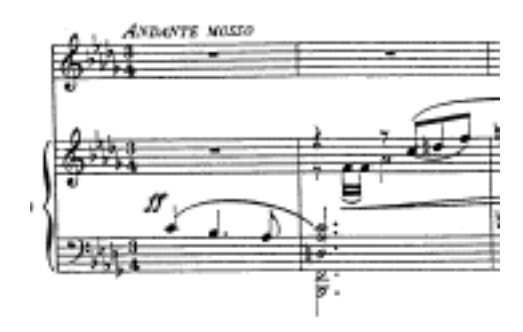
FIGURE 2.23: "Sole d'autunno," measures 1-2.

Secondly, there is a recurring sighing motive that appears throughout the song in both the vocal part and the accompaniment. Its element, as is initially presented, is always descending. The sighing motive, coupled with the earlier syncopated element, reinforces the languid quality of this final song.