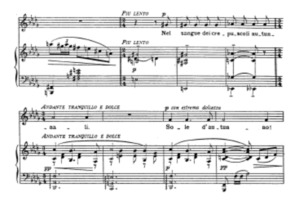
FIGURE 2.26: "Sole d'autunno," measures 82-88.

The composer is very clear in his tempo indications, which should be strictly followed for the best dramatic interpretation of the song.