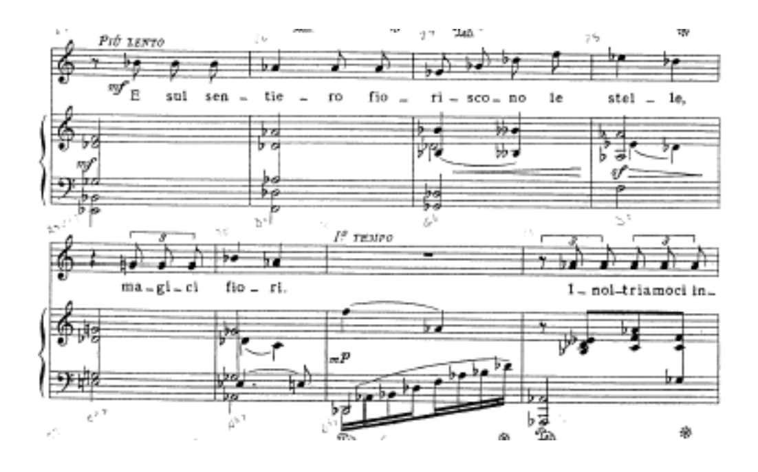
Figure 2.2: "L'assiolo canta," measures 25-30.

Beginning with a mezzo piano (medium soft) dynamic in the accompaniment, Santoliquido requests the same dynamic when the voice enters, except that he adds con semplicità (with simplicity). The beginning dynamics in both the keyboard and the voice enhance the mood of one entering the woods at night. At piú lento (more slow) in measure 25 the dynamic increases to mezzo forte (medium loud) to reflect a climatic moment in the music.