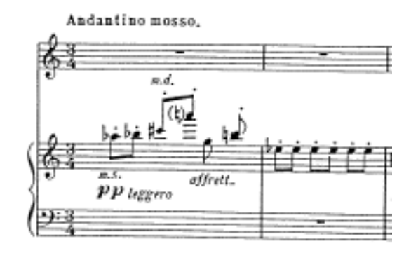
FIGURE 2.42: Petits poëmes [sic] japonais, "III," measures 1-2.

The sparse texture of this third song is shown in two elements that recur throughout. The first is introduced in the opening two measures and is in two parts. These two measures recur later in the song in the same key.