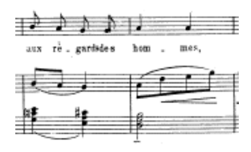
FIGURE 2.36: Una lirica giapponese, measures 56-57.