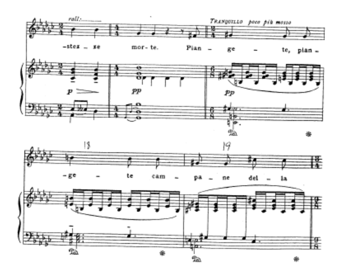
FIGURE 2.8: "Tristezza crepuscolare," measures 17-20.

The tempo marking of lento e triste (sad and slow) implies a range of quarter note equals 50 to 54. This slow tempo enables the singer to easily handle the more syllabic portions of the text. As with the other songs in this set, Santoliquido is very specific with his tempo indications: measures 1-10, Lento e triste ; measures 11-13, più mosso (more movement), with a stentendo (laboring) at measure 14; measure 15, rallentando (slowing); measure 17-28, tranquillo , poco più mosso (tranquil, with a little more motion); measures 29-38, movendo (moving); and measures 39 to 41, assai lento (very slow).