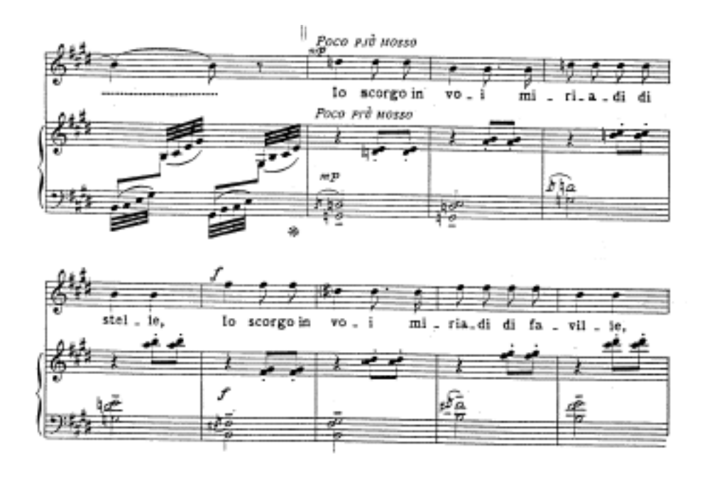
FIGURE 2.16: "Riflessi," measures 26-33

Measures 50-60 are in D-flat major, while measures 61-72 are chromatic in nature. It is not until measure 72 that there is a firm cadence in E major.