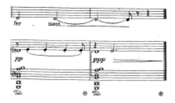
FIGURE 2.47: Mélancolie , measures 42-43. E-flat pedal point at final cadence.