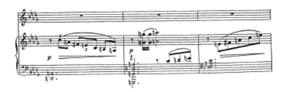
FIGURE 2.25: "Sole d'autunno," measures 34-36.

From "Riflessi," broken chords accompany the singer, in much the same way as Figure 2.25.