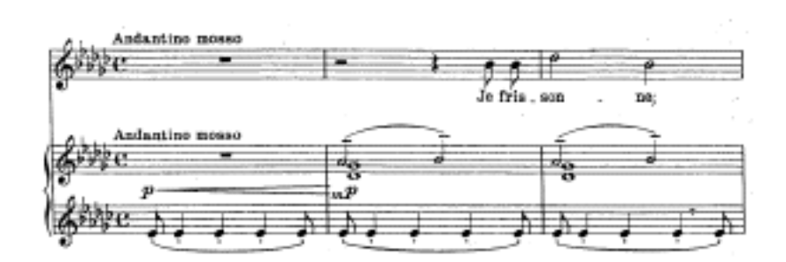
FIGURE 2.46: Mélancolie , measures 1-3. E-flat pedal point at beginning.

The piece begins with what could be either an e-flat minor 7th chord (Eb-Gb-Bb-Db) or a G-flat major chord with an added 6th (Gb-Bb-Db-Eb). In the beginning of the piece, the Eb seems to function as a pedal point, which gives it more of an impression of Eb minor than Gb major, and the melody descends to Eb in measure 8, which would support Eb minor as the key. However, at the end of the piece, the final chord seems to be very clearly scored as a Gb major chord with an added 6th, even though the Eb is once again serving as a pedal point. <sup>50</sup>