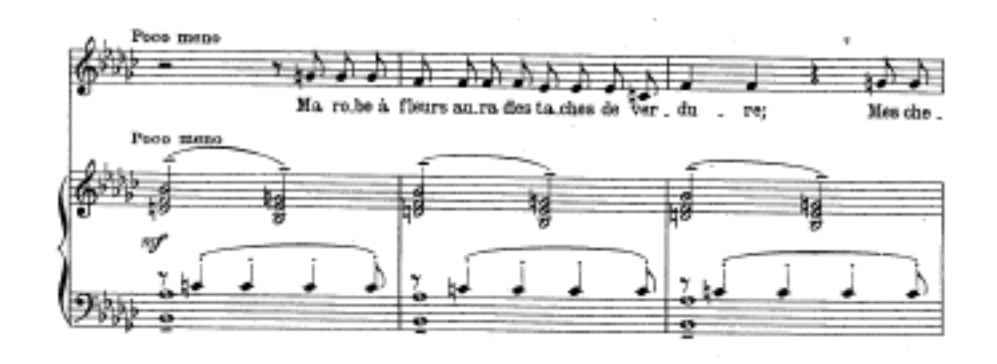
FIGURE 2.48: Mélancolie, measures 12-14.

As with many of his other selections, Mélancolie is written with speech rhythms in mind, resulting in recitative-like passages. The piano part provides a steady anchor for rhythmic vitality in the vocal line.