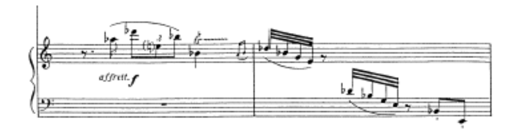
FIGURE 2.41: Petits poëmes japonais, "II," measures 10-11.

The tempo of this song seems to work well when the quarter note equals 68 to 72 beats per minute. One should be advised against a tempo too fast in light of the tempo indication of assai lento (very slow) written by the composer.