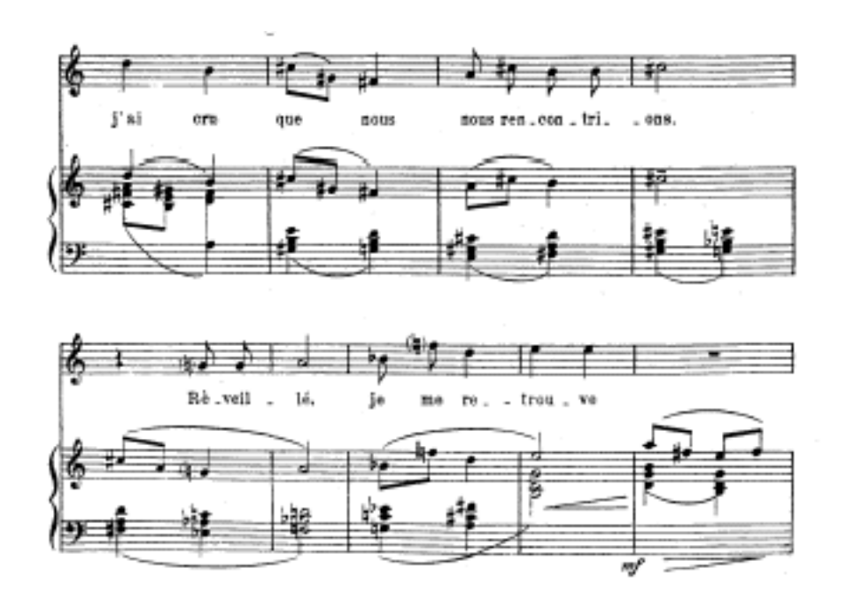
FIGURE 2.35: Una lirica giapponese , measures 5-13.

can be found in Una lirica giapponese . First, measures 6-10 have almost completely parallel chords in the bass line that move seemingly without harmonic function.