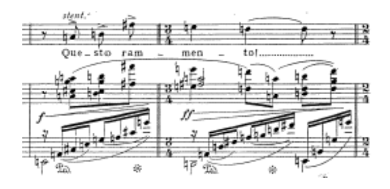
FIGURE 2.12: "L'incontro," measure 23 to 24, "Questo rammento!"