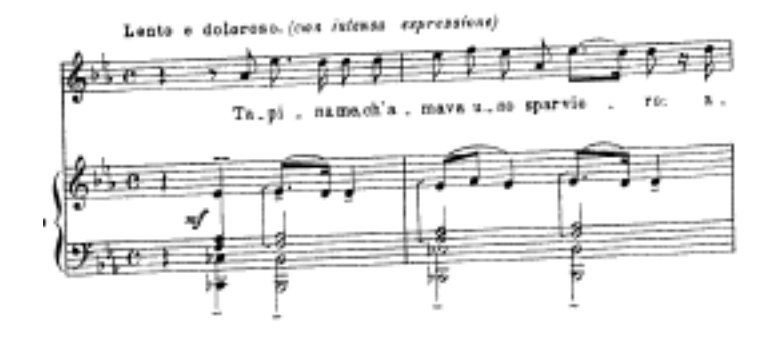
FIGURE 2.32: Antica stampa italiana, measures 1-2 (showing mixolydian mode.)