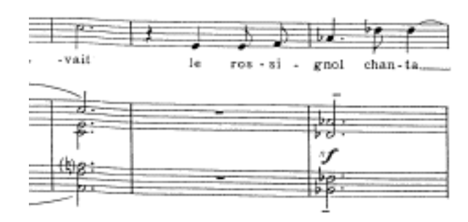
FIGURE 2.40: Petits poëmes[sic] japonais, "II," measures 8-9.

The texture of this song (and the next) is sparse, with moments of complete silence in the accompaniment. The soprano line of the piano doubles the voice line in all but two measures of the song.