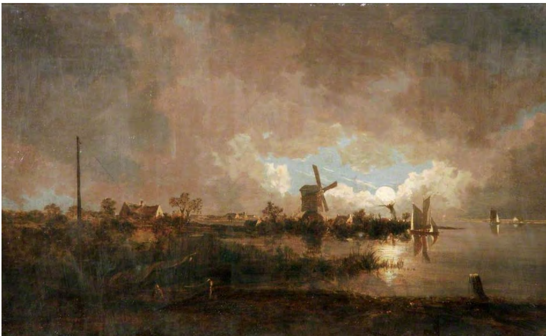
Figure 21. John Berney Crome, Moonlight Scene , 1823, 14 x 23 inches, Norfolk Museums and Archaeology Service (Norwich Castle Museum and Art Gallery)