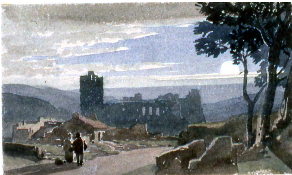
Figure 36. William Leighton Leitch, Moonlight Study: three-stage drawing demonstration, part 3 , watercolor, 3 x 5 1/2 inches, Royal Collection Trust.