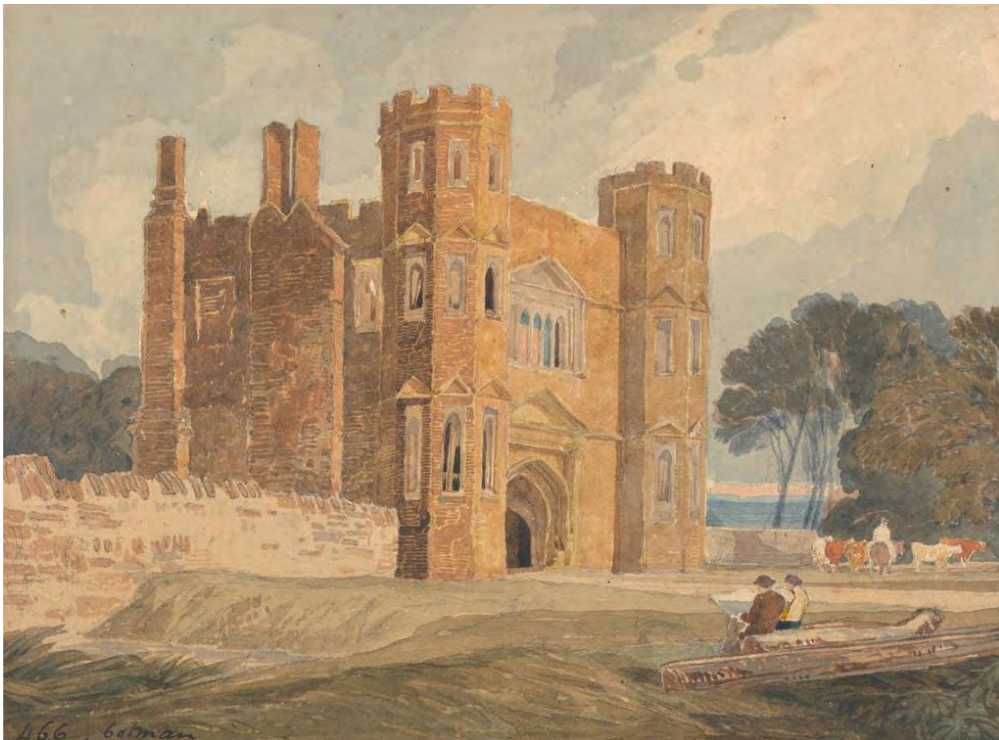
Figure 26. John Sell Cotman, Gate-way , 1818, watercolor, 7 3/8 x 10 inches, Yale Center for British Art.