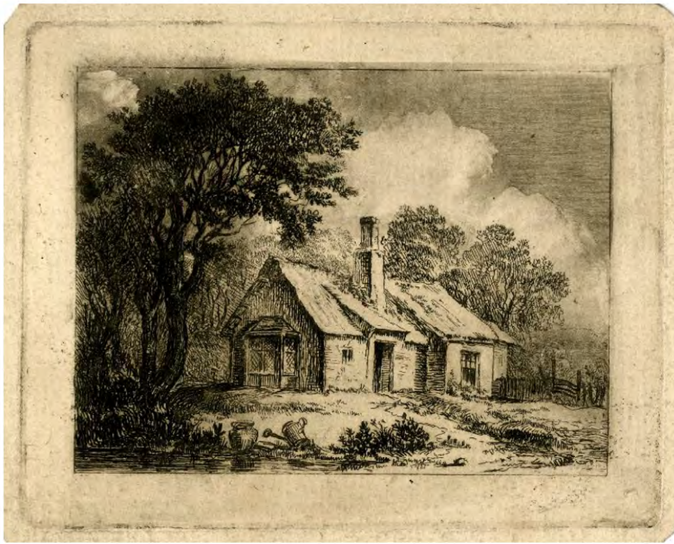
Figure 8. Alexander Nasmyth, Untitled , etching with grey wash, 4 x 5 inches, British Museum.