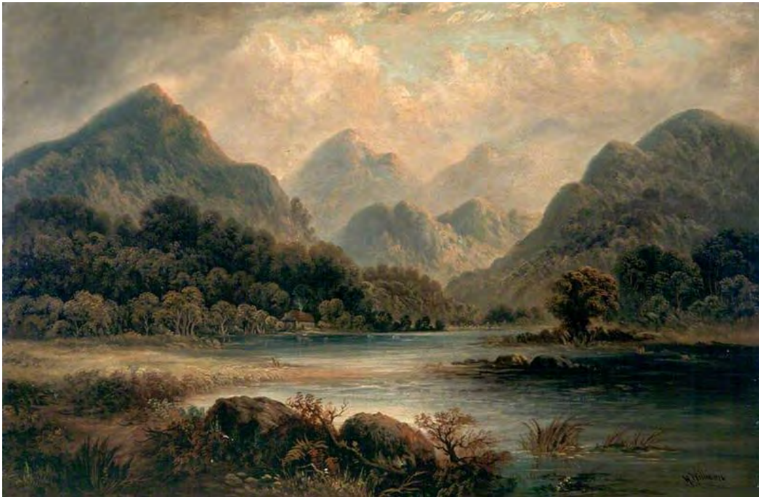
Figure 16. Hugh William Williams, Glencoe Highlands , n.d., oil on canvas, 24 x 36 \frac{1}{4} inches, Aberdeen Art Gallery and Museums.