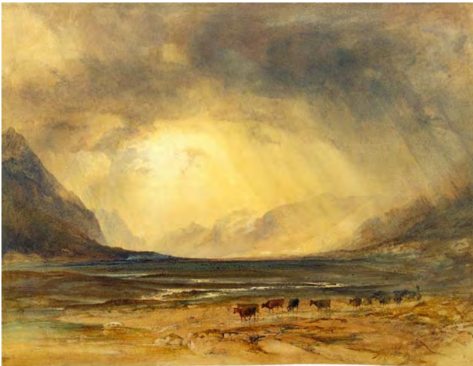
Figure 13. Anthony Vandyke Copley Fielding, The Head of Glencoe , 1823, pencil and watercolor with touches of white body-color, 12 x 16 inches, The Morgan Library and Museum.