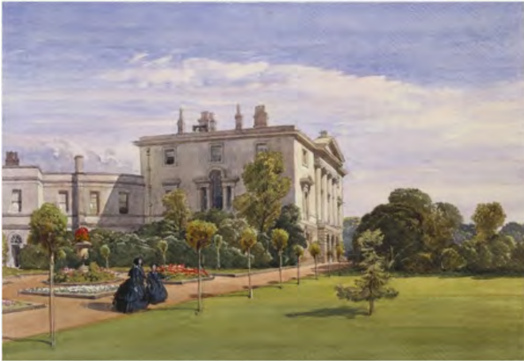
Figure 25. William Leighton Leitch, The White Lodge , 1861, watercolor, 9 ¼ x 13 ½ inches, The Royal Collection Trust.