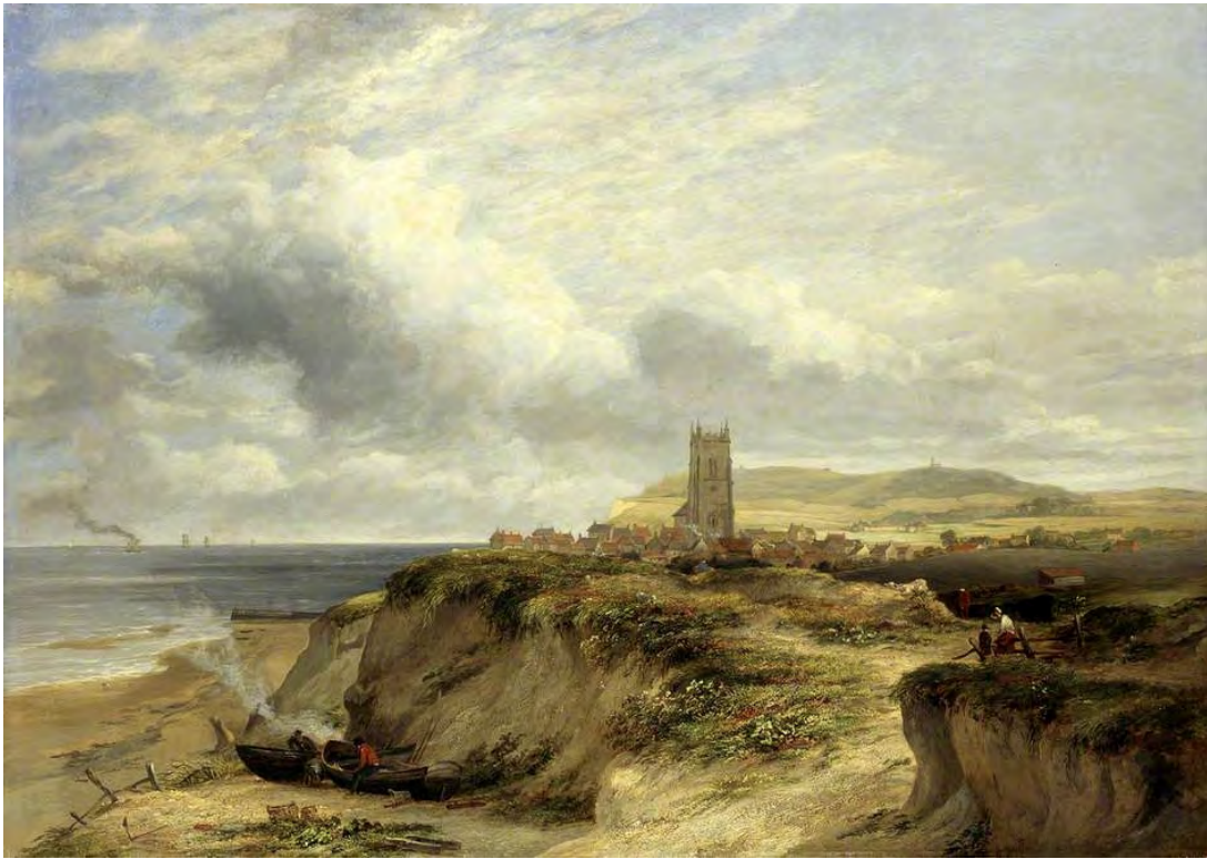
Figure 20. James Stark, Cromer, Norfolk , c.1837, oil on deal panel, 24 x 33 \frac{3}{4} inches, Norfolk Museums and Archaeology Service (Norwich Castle Museum and Art Gallery)