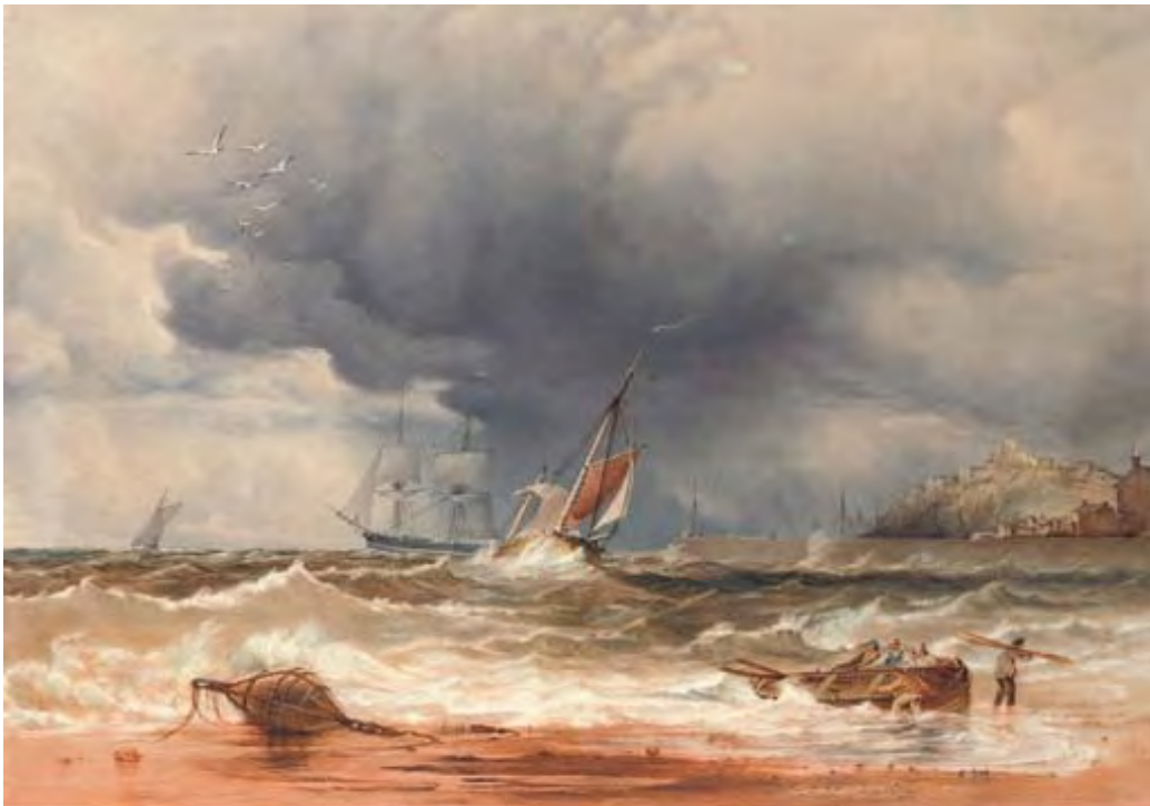
Figure 11. Anthony Vandyke Copley Fielding, A Sea Piece , n.d., pencil and watercolor with scratching out, 16 x 22 \frac{3}{4} inches.