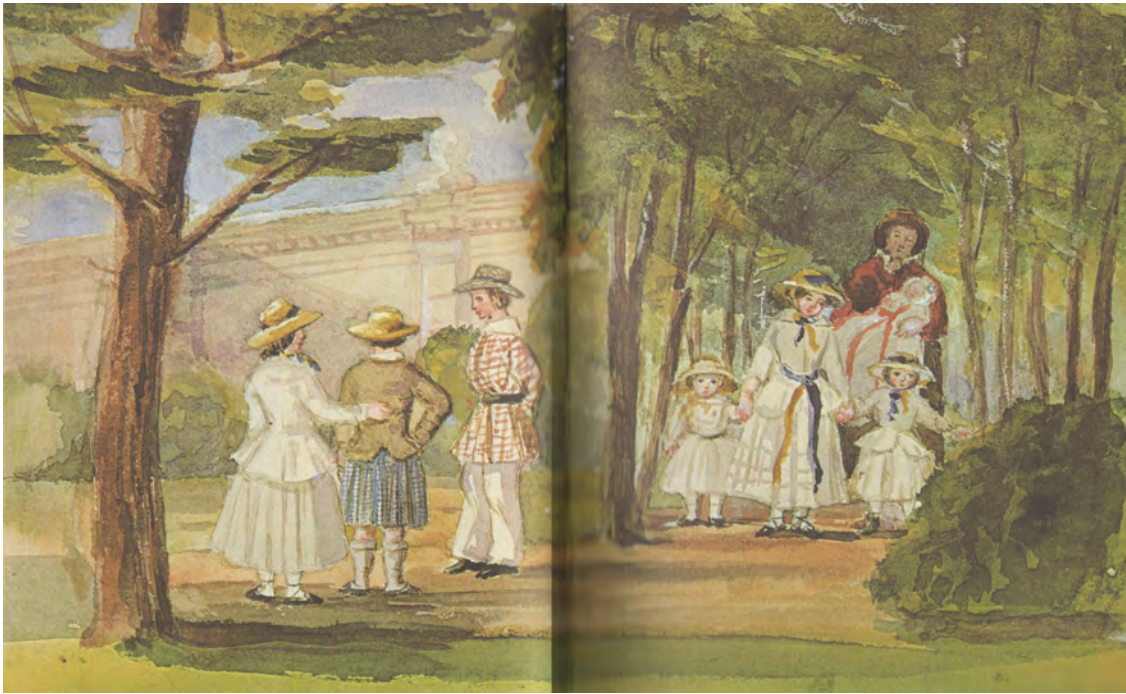
Figure 37. Queen Victoria, Family Scene, Osborne House , 1850, watercolor, The Royal Collection Trust.