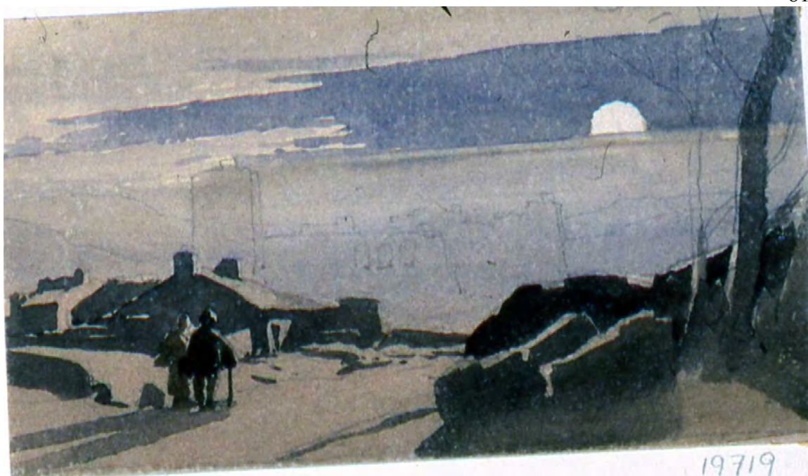
Figure 35. William Leighton Leitch, Moonlight Study: three-stage drawing demonstration, part 2 , watercolor, 3 x 5 1/2 inches, Royal Collection Trust