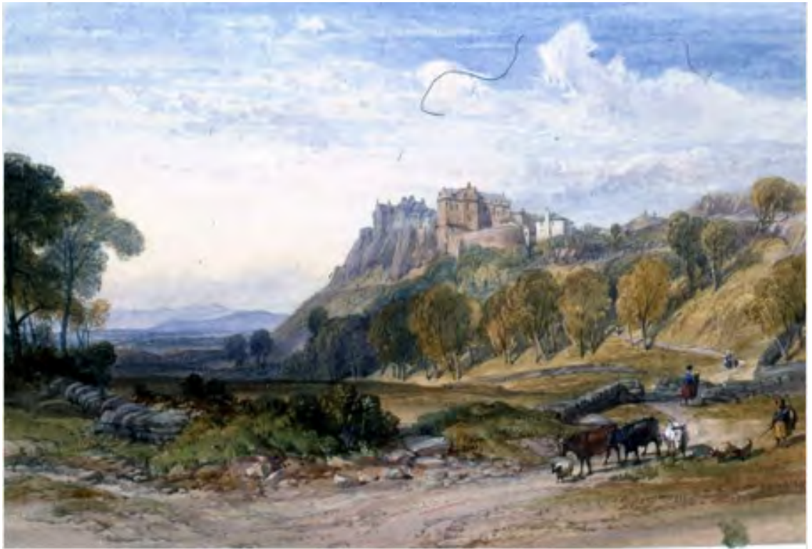
Figure 27. William Leighton Leitch, Stirling Castle , 1842, watercolor, 10 x 14 ½ inches, The Royal Collection Trust.