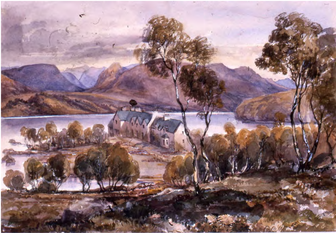
Figure 33. Viscountess Charlotte Canning, Ardverikie, Loch Laggan , watercolor, 9 ½ x 13 ½ inches, Royal Collection Trust.