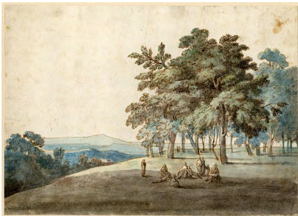
Figure 7. Alexander Nasmyth, A Classical Landscape , n.d., pen, brown ink, and watercolor on paper, 6 \frac{1}{2} x 9 inches, British Museum.