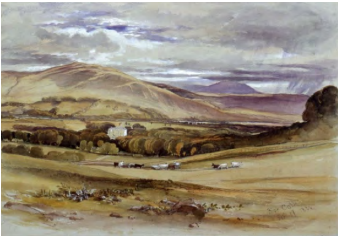
Figure 17. William Leighton Leitch, Blair Castle , 1844, watercolor, 9 \frac{1}{2} x 14 inches, The Royal Collection Trust.