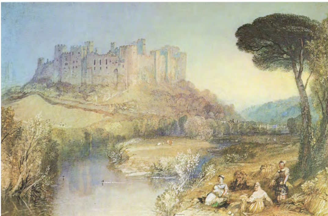
Figure 30. J.M.W. Turner, Ludlow Castle, Shropshire , c.1830, watercolor, 12 x 18 inches, Private Collection.