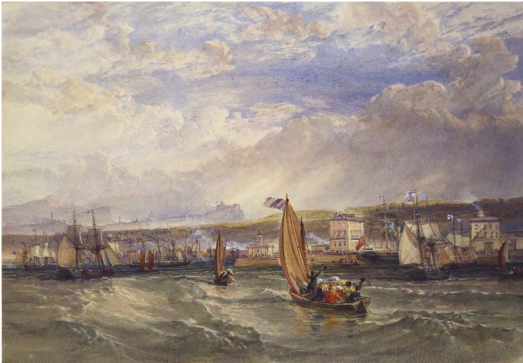
Figure 10. William Leighton Leitch, Queen Victoria Landing at Granton Pier , n.d., watercolor, 10 x 14 inches, The Royal Collection Trust.