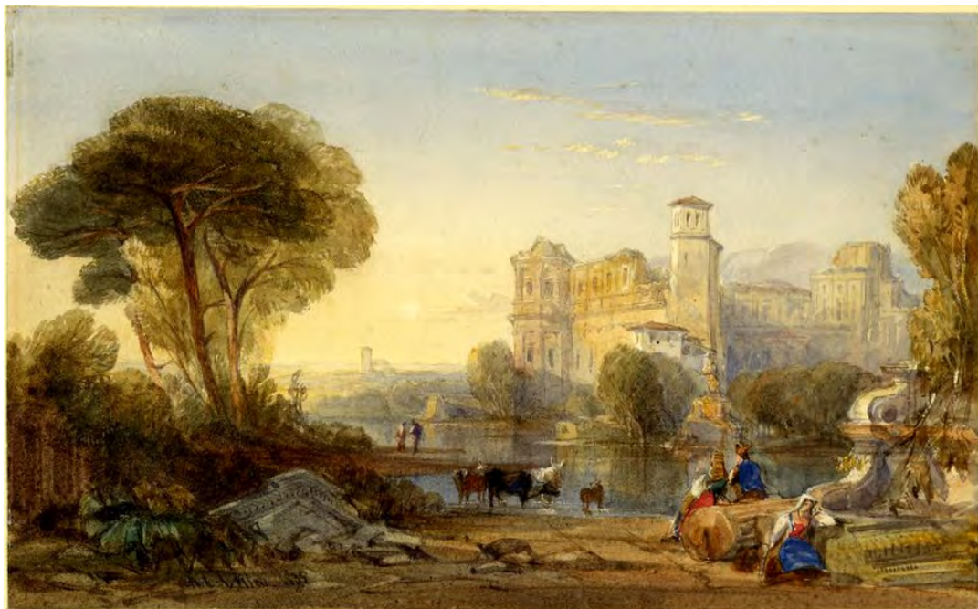
Figure 15. William Leighton Leitch, Untitled , 1838, watercolor, 6 x 10 inches, British Museum.