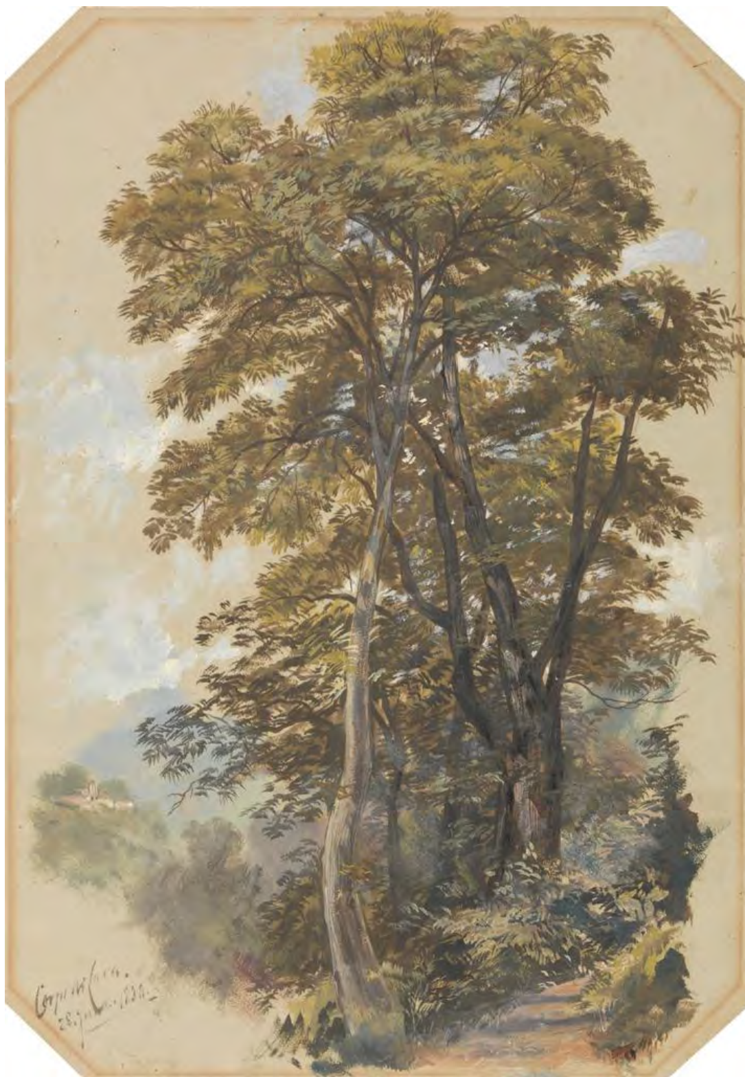
Figure 24. Edward Lear, Corpo di Cava , 1838, oil and gouache, 14 1/8 x 9 13/16 inches, Yale center for British Art.