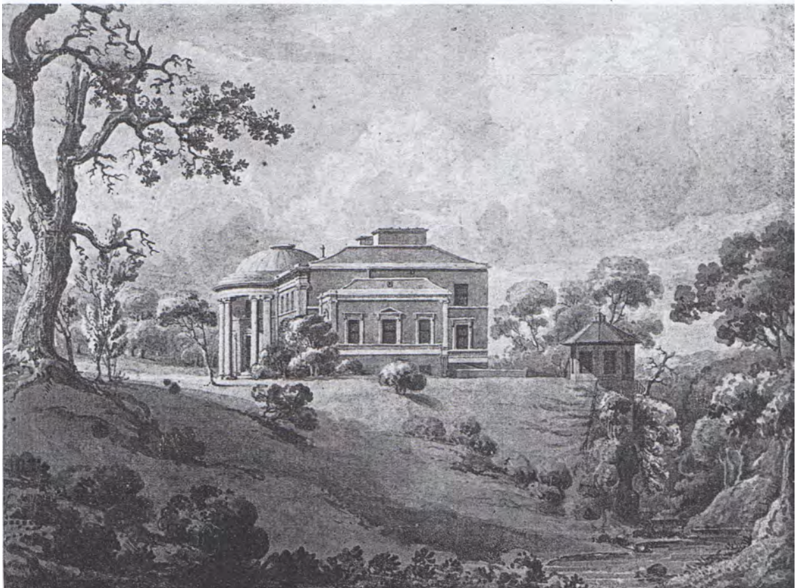
Figure 5. William Leighton Leitch, Coilsfield House , c.1830, sepia on paper, 6 \frac{3}{4} x 8 \frac{3}{4} inches, A. A. Tait Collection.