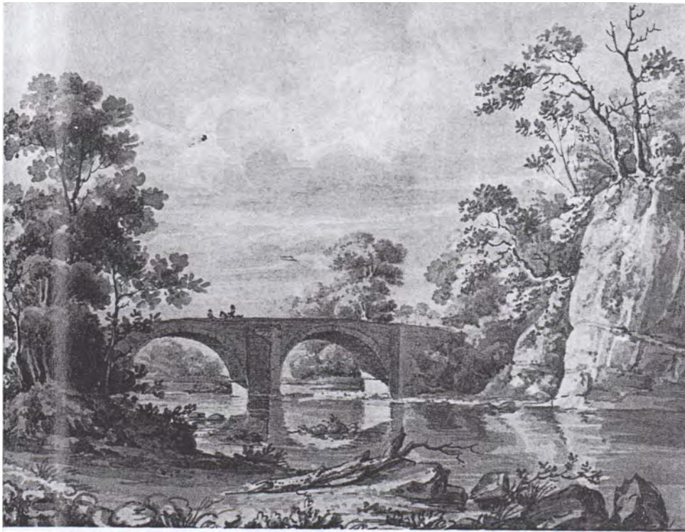
Figure 6. William Leighton Leitch, Howford Bridge , sepia on paper, 6 \frac{3}{4} x 8 \frac{3}{4} inches, Martin Kemp Collection.