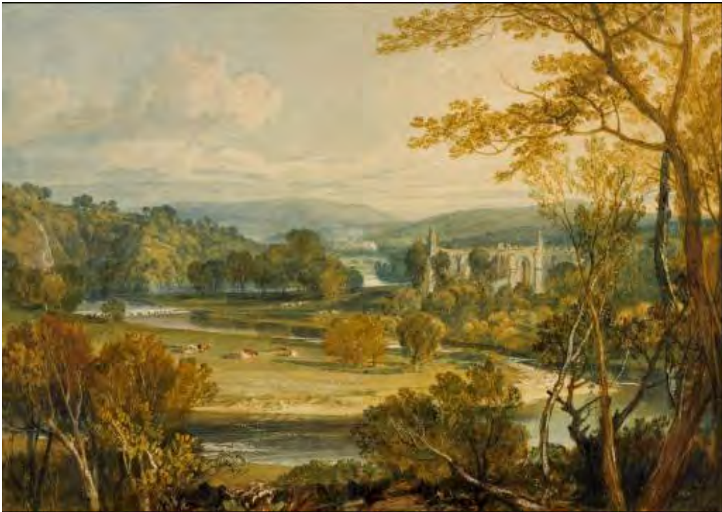
Figure 32. J.M.W. Turner, Bolton Abbey, Yorkshire , 1809, watercolor, 11 x 15 \frac{1}{2} inches, The British Museum.