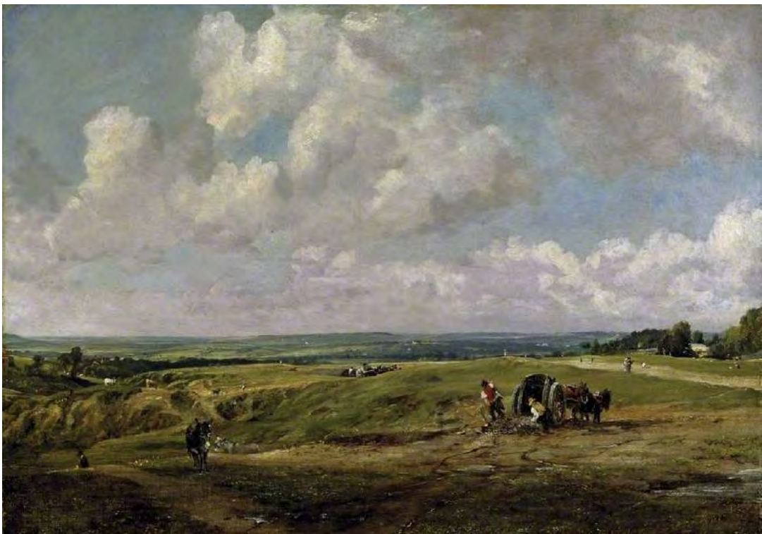
Figure 19. John Constable, Hapstead Heath , c.1820, oil on canvas, 21 \frac{1}{4} x 30 \frac{1}{4} inches, The Fitzwilliam Museum.