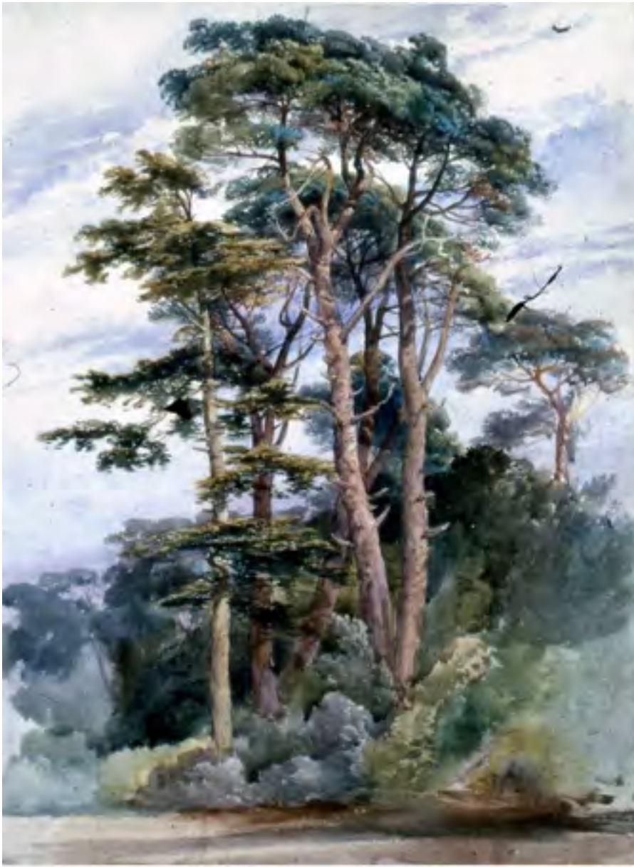
Figure 23. William Leighton Leitch, Study of Fir Trees , n.d., watercolor, 19 x 14 inches, The Royal Collection Trust.