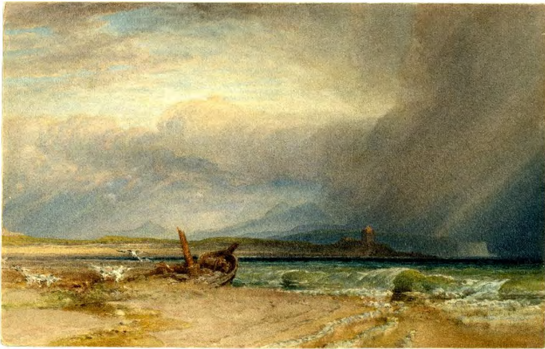
Figure 12. William Leighton Leitch, Island of Jura, Western Isles , n.d., watercolor with touches of white body-color on card, 9 x 13 ½ inches, British Museum.