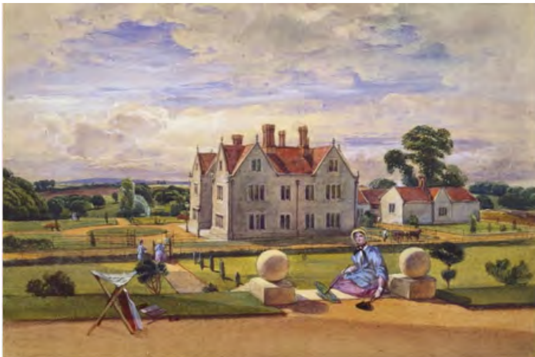
Figure 38. William Leighton Leitch, Barton Farm , c.1850, watercolor, 12 x 18 inches, The Royal Collection Trust.