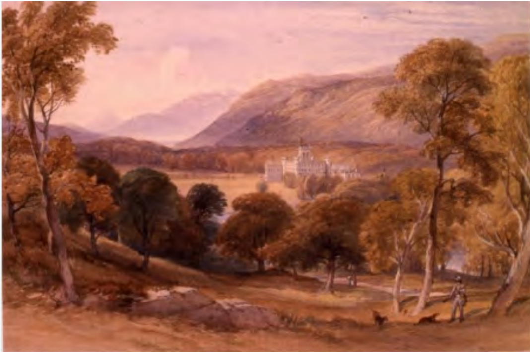
Figure 31. William Leighton Leitch, Taymouth Castle , 1842, watercolor, 9 \frac{3}{4} x 14 \frac{1}{4} inches, The Royal Collection Trust.