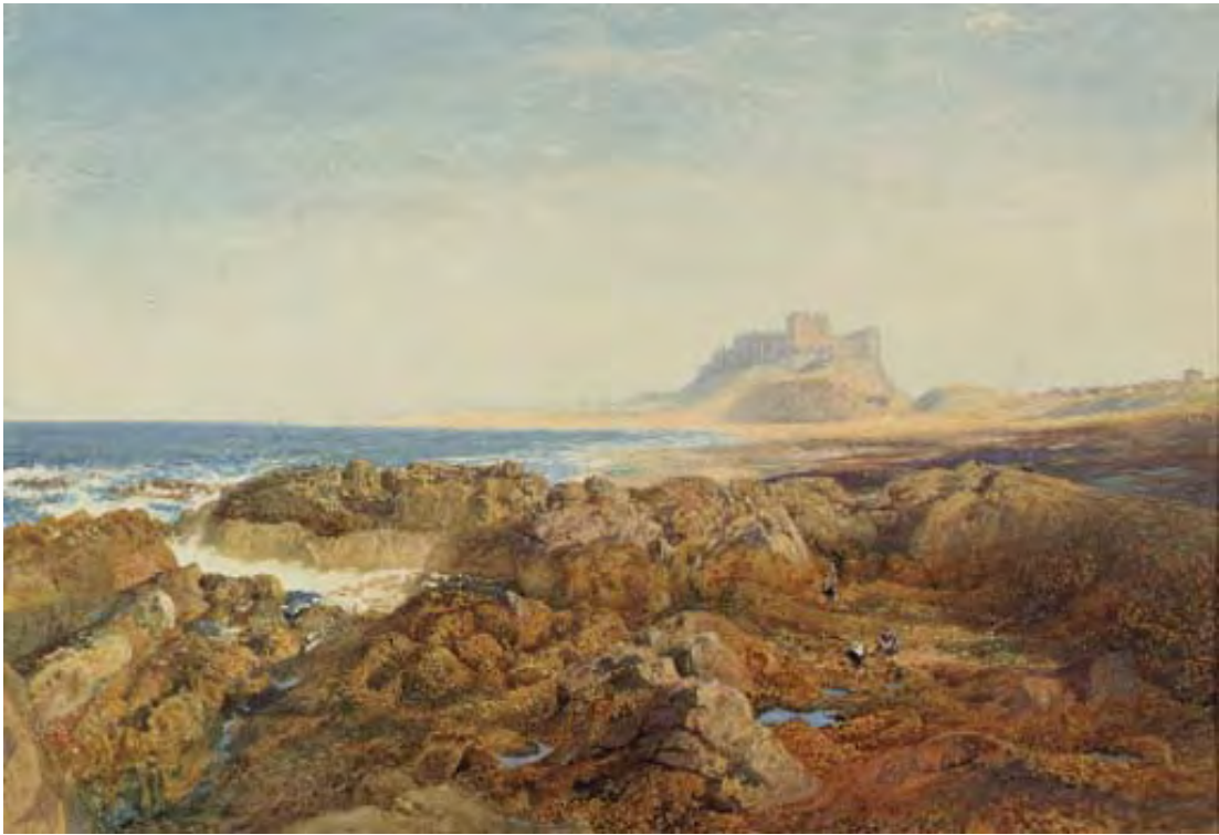
Figure 22. Alfred William Hunt, Bamborough Castle , 1871, pencil and watercolor with gum Arabic, touches of body-color and scratching out, 15 x 21 \frac{3}{4} inches, The Fuller Collection.