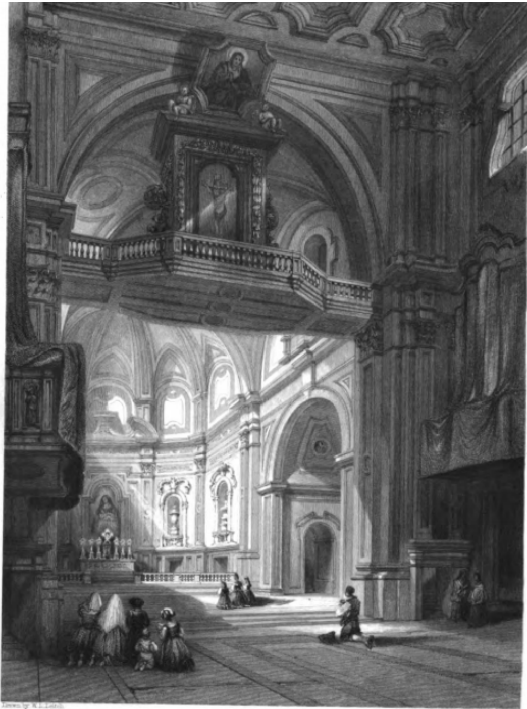
Figure 3. William Leighton Leitch, The Church of Santa Maria del Carmine from The Rhine, Italy and Greece , 1840, engraving.