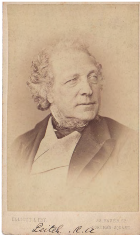
Figure 1. Elliott & Fry, William Leighton Leitch , 1860s, albumen carte-de-visite, 3 5/8 x 2 1/4 inches, author's collection.