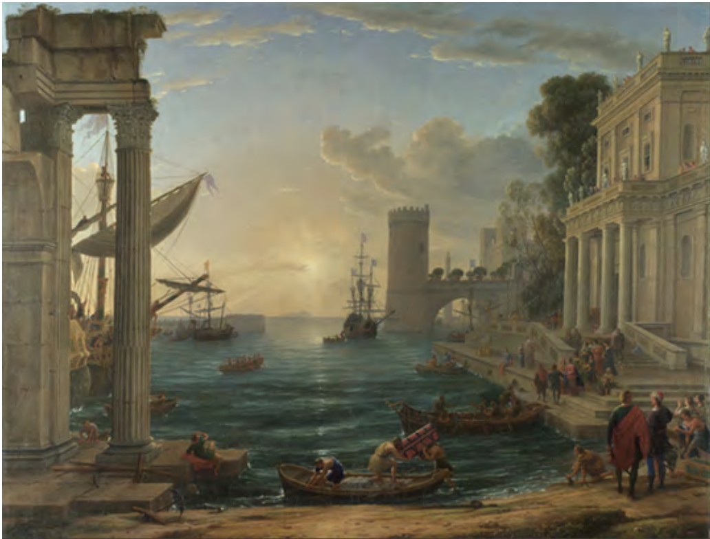
Figure 14. Claude Lorrain, Seaport with the Embarkation of the Queen of Sheba , 1648, oil on canvas, 58 \frac{3}{4} x 77 \frac{1}{4} inches, National Gallery London.