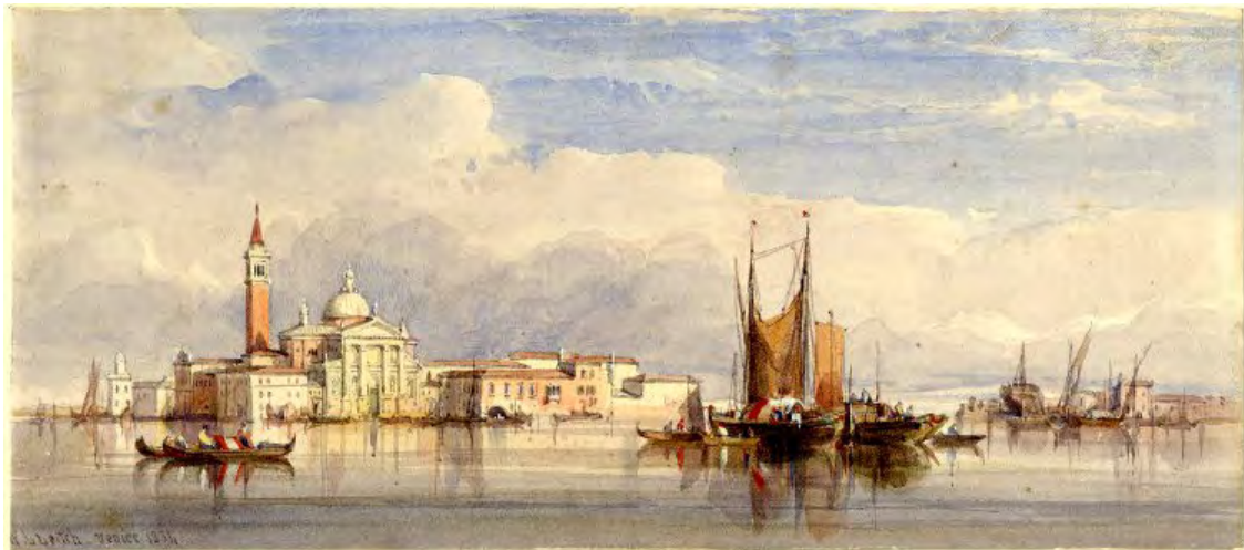
Figure 2. William Leighton Leitch, San Giorgio Maggiore, Venice , 1834, watercolor, 4 1/4 x 9 1/2 inches, British Museum.