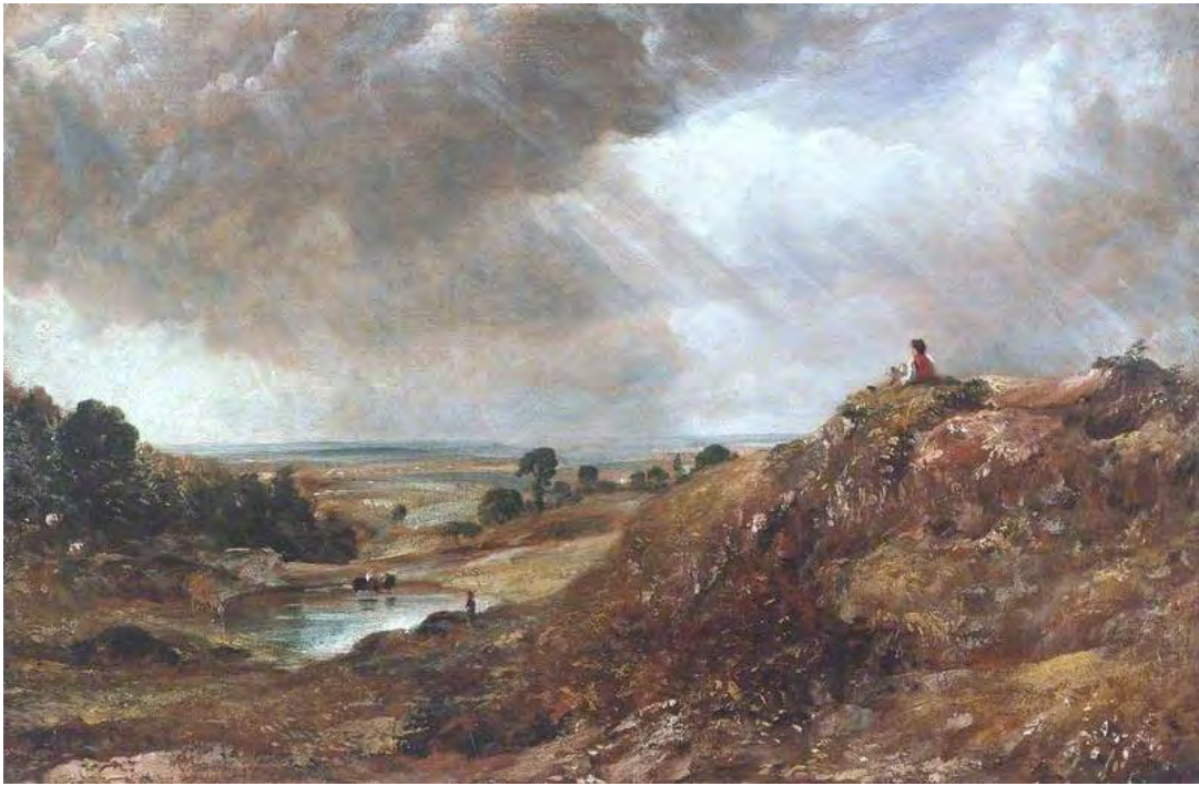
Figure 18. John Constable, Branch Hill Pond, Hampstead Heath, with a Boy Sitting on a Bank , c.1825, oil on canvas, 13 x 19 \frac{3}{4} inches, Tate.