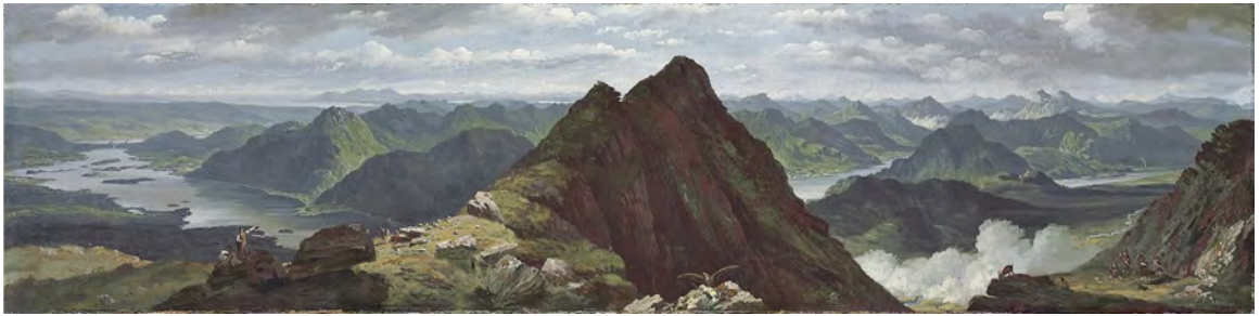
Figure 4. John Knox, View of Loch Lomond , n.d., oil on canvas, 12 \frac{1}{4} x 48 \frac{1}{4} inches.