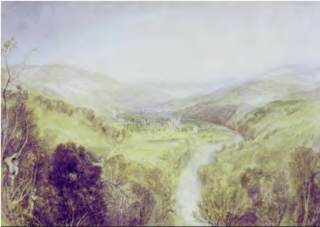
Figure 29. J.M.W. Turner, Buckfastleigh Abbey, Devonshire , c.1825-7, watercolor, 11 x 15 1/2 inches, Tate Britain.