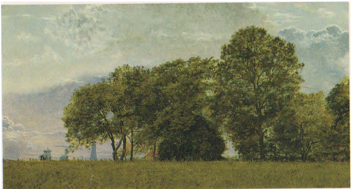
Figure 28. Christen Købke, View from the Citadel Wall, with the Towers of the Church of Our Lady and St. Petri Church in the Background , 1833, oil on paper, mounted on canvas, 6 ¼ x 11 5/8 inches, Hirschsprungske Samling, Copenhagen.