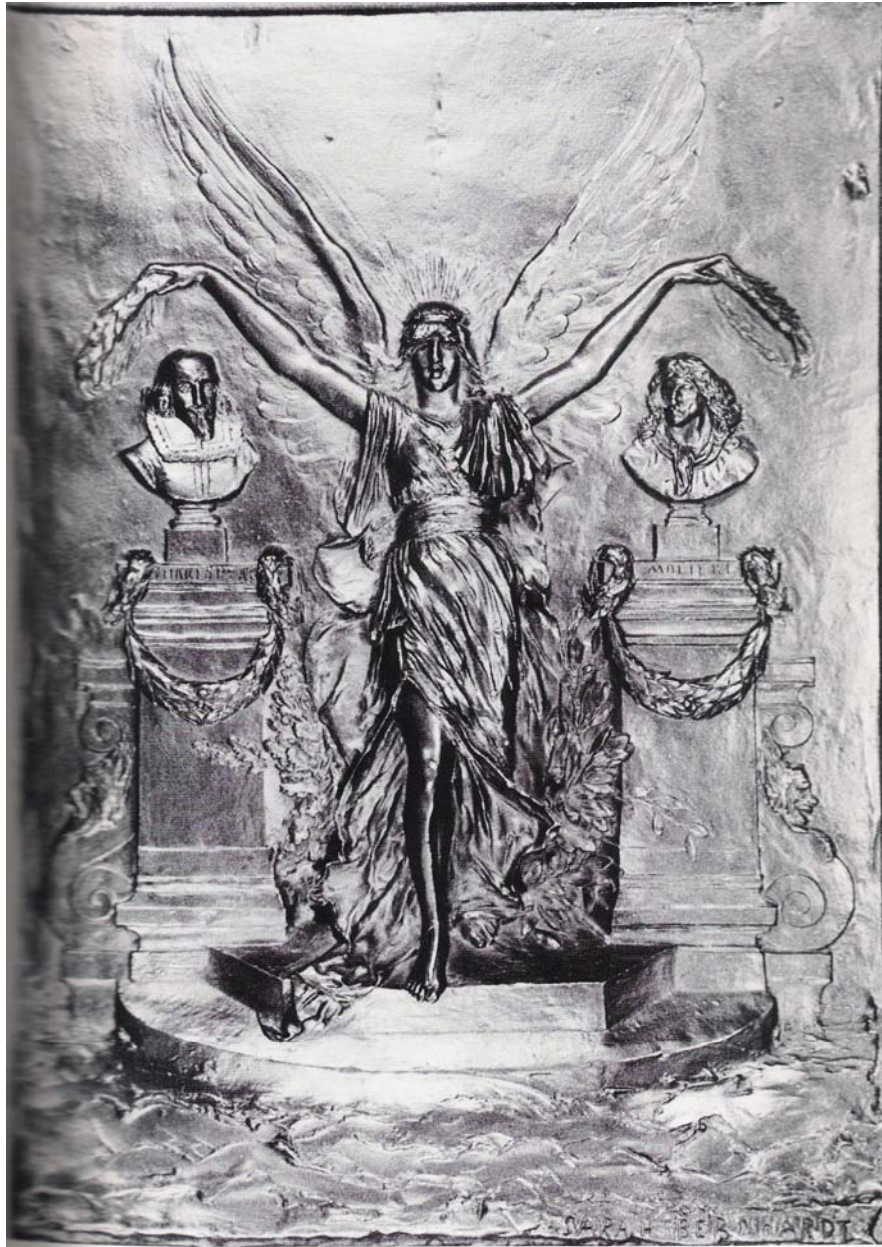
Figure 9. Muse crowning the busts of Shakespeare and Molière, sculpture by Sarah Bernhardt.

drawing by Clairin. The drawing shows Sarah, in a flowing gown, stepping forward holding palms in her outstretched hands. 27