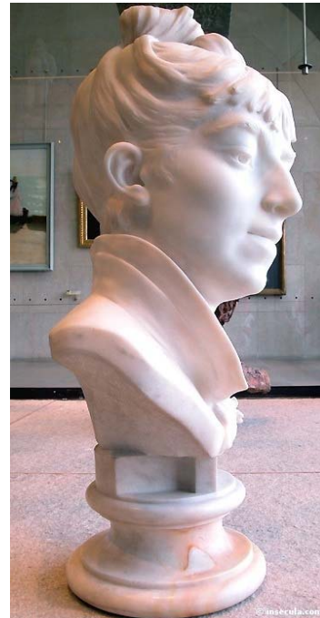
Figure 6. Bust of Louise Abbema, Sarah Bernhardt. Figure 7. Alternative view.