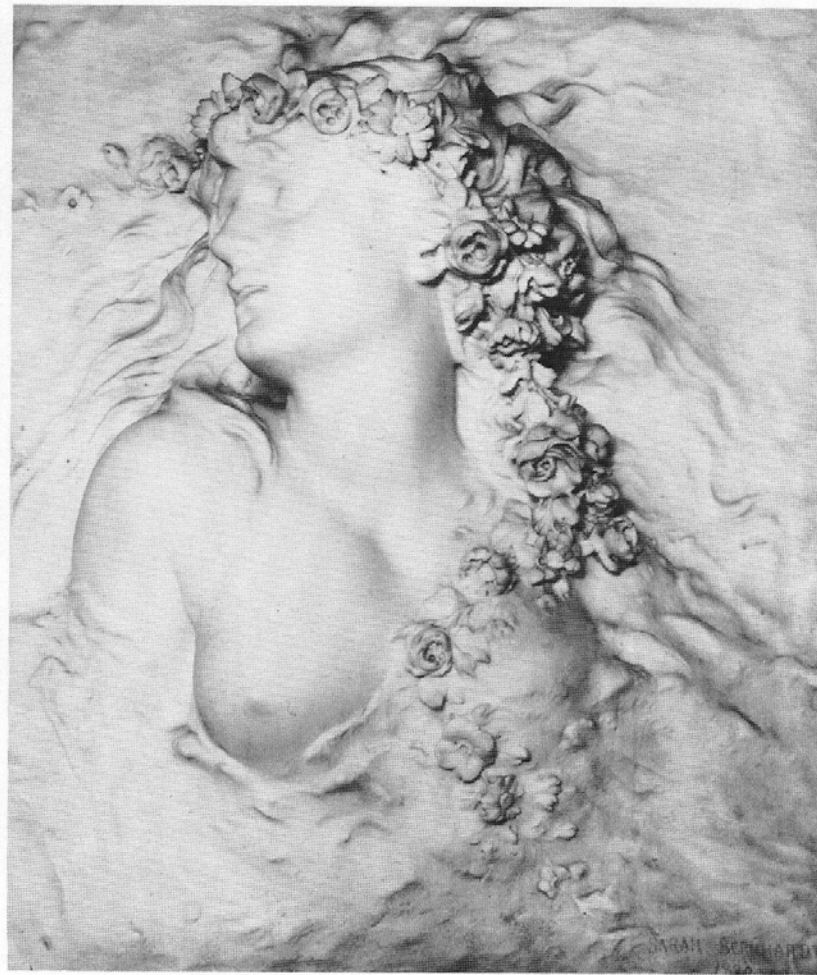
Figure 5. Bas-relief of Ophelia, by Sarah Bernhardt.

by a representative gallery almost immediately after being exhibited (fig. 5). Her allegorical Figure of Music was eventually installed in the Monte Carlo Casino. 20