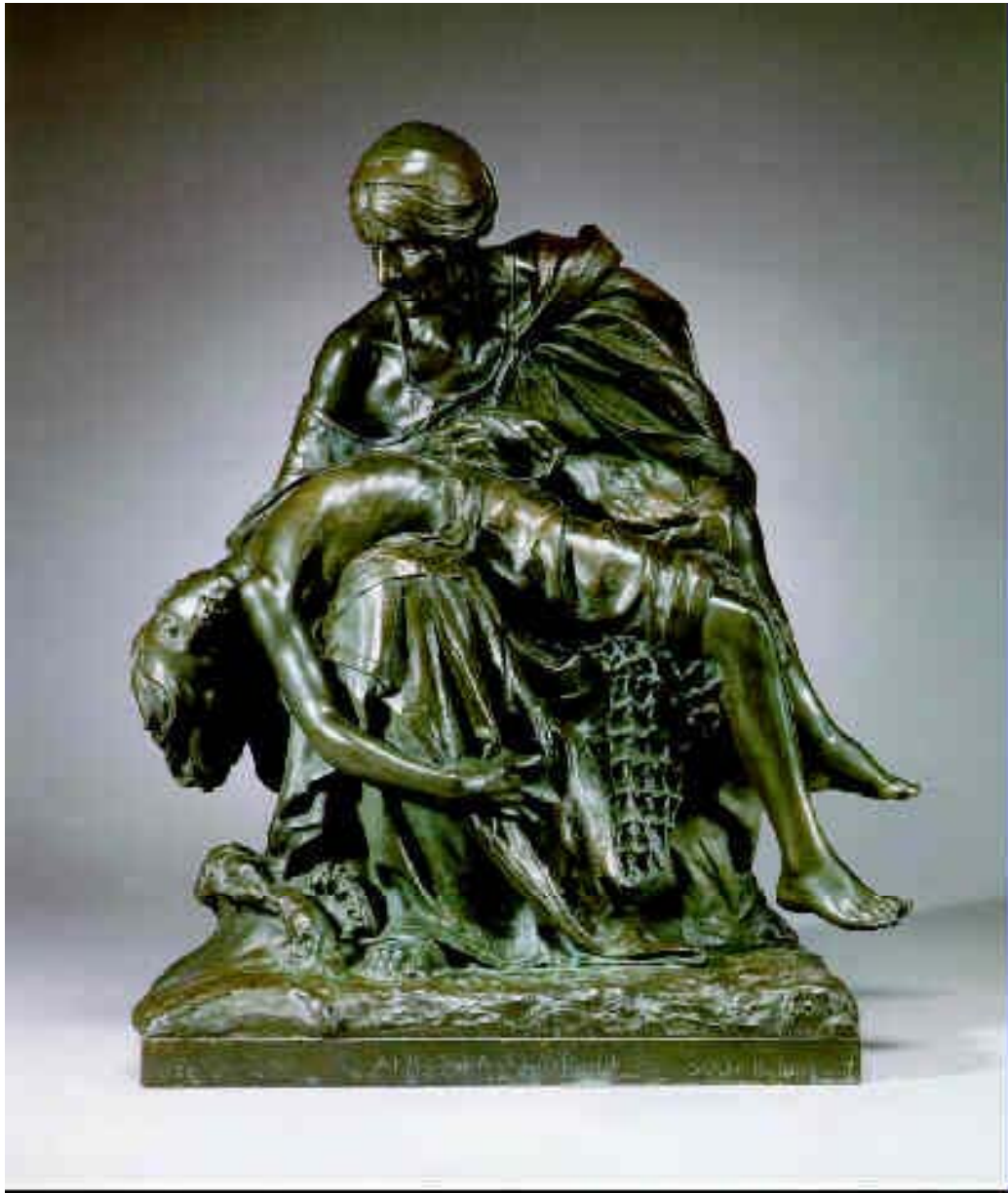
Figure 1. Après la tempête , sculpture by Sarah Bernhardt.

also showed Clairin's famous portrait of Sarah lying on the divan, along with Sarah's own sculptural group Après la Tempête (fig. 1). 1