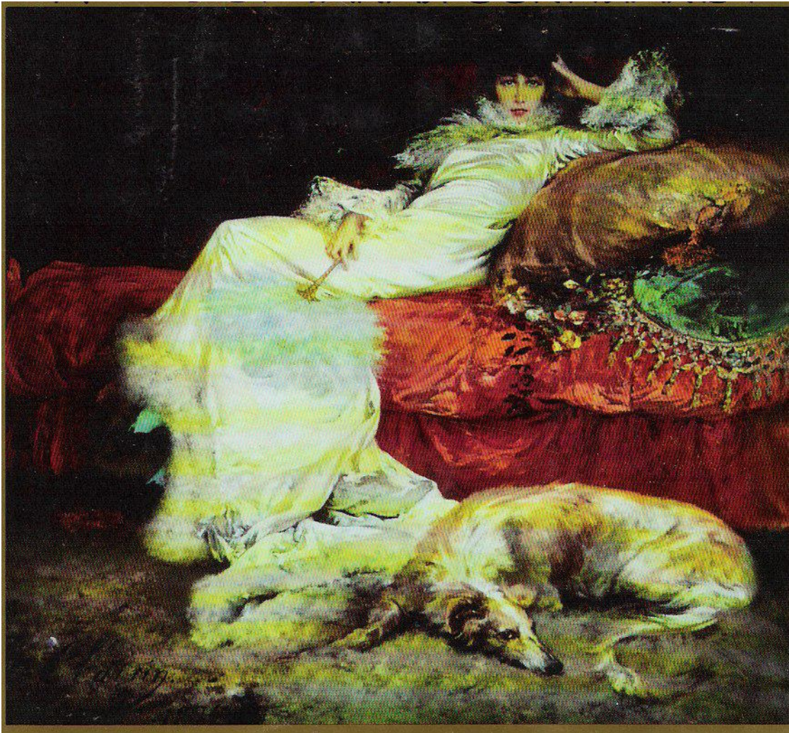
Figure 3. Portrait of Sarah Bernhardt, by Georges Clairin.

propriety, plays a Parisian sphinx with more secrets from the world than the world considered proper. 9