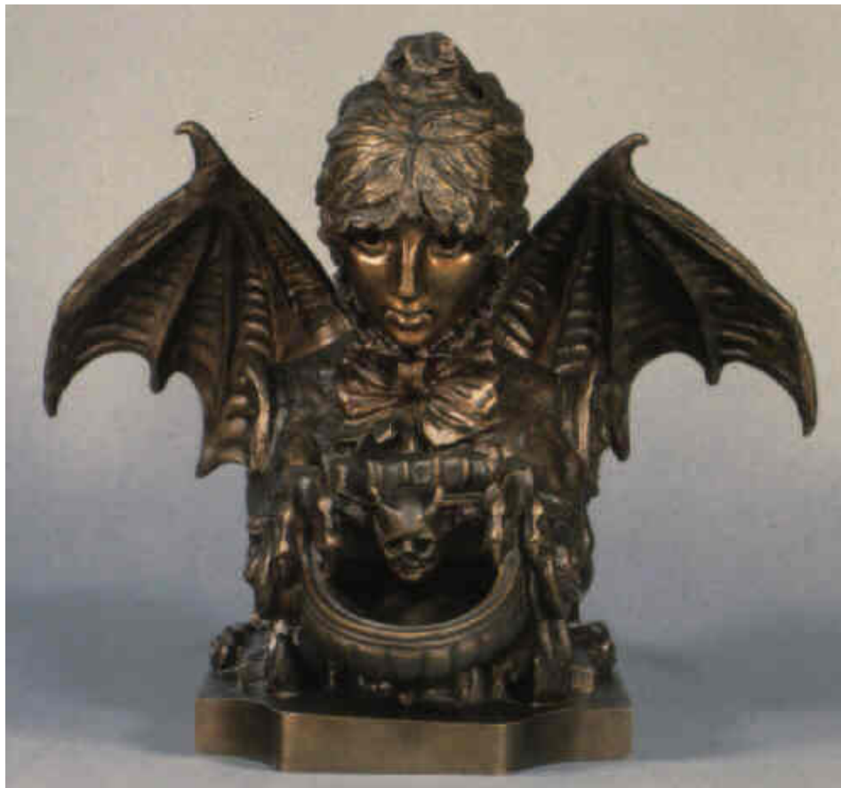
Figure 4. Inkstand, sculpture by Sarah Bernhardt.

costumes, and so on to ensure that they continued to occupy a place apart from the rest of society. For her part, Bernhardt was a woman who went against what was considered proper public behavior even for one “liberal” enough to be an artist. There were many women artists during that time, so the fact that Sarah was an artist wasn’t the major factor—her public androgyny and bisexuality was.