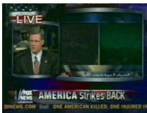
Figure 10: FOX News Channel.