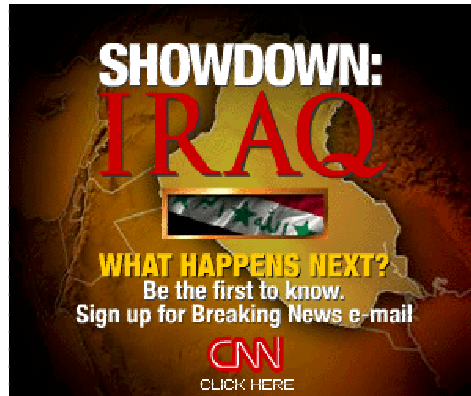
Figure 4: CNN.com.

But beyond market competition, CNN—along with MSNBC and FOX—was continuing to build a narrative by playing up the laws of conflict. Placing the Iraq story in the context of a “showdown” is in itself a cinematic act. The showdown is a classic form of conflict in American cinema, seen most often in the Western genre. But what is most crucial about this narrative and visual framing is its creation of an “us versus them” dynamic. The decision makers in media organizations, whether consciously or not, allied themselves not with the enemy, not with the people, but with the attacking force of the war, the military, and with the Bush Administration as the ideological presence behind that force. Additionally, this alliance reveals the level of ferocity in the media ratings war during the supersaturated era of digital media when the competition for an audience can be so driven. After all, in what other era would the news media be required to sensationalize conflict in a time of war—a story that has already built within it more conflict than any film could ever hope to have?