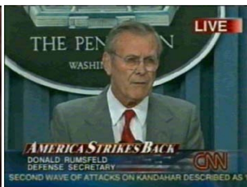
Figure 9: CNN