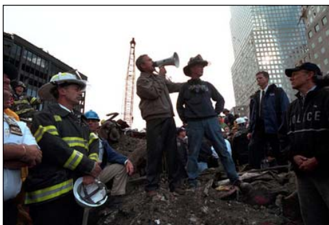
Figure 6: President Bush speaking at Ground Zero.

Ronald Reagan who was often photographed horseback riding and Lyndon Johnson who played up his past as a Texas rancher. The media did not invent Bush's cowboy image. The cowboy imagery is iconic in American history and culture—and particularly in the American cinema. Cowboy boots, hats, Western-styled shirts, ranch settings, and outdoor imagery are all components of the cowboy character in film and were adopted by George W. Bush long before he ascended to the presidency. The image was a logical character for Bush to adopt. He is a Texan, he fancies himself a rancher, and he possesses a philosophy of life that mimics the over-simplified, good-versus-evil nature of iconic Western figures such as John Wayne in The Searchers (1956) who seeks to right a wrong done against his own. Or Gary Cooper who has on his side a tremendous sense of pride and duty in the film High Noon (1952). Had President Bush not adopted this imagery, it is quite possible his political career may never have gotten off the ground.