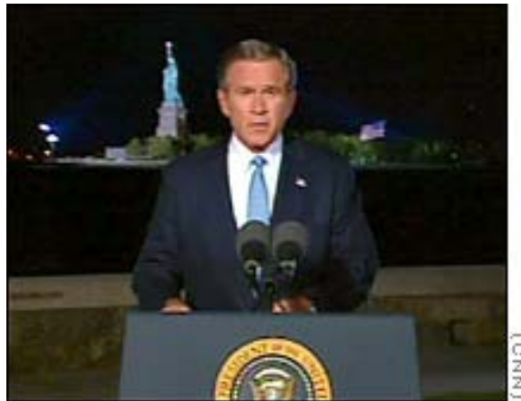
Figure 5: President Bush speaking at Ellis Island.