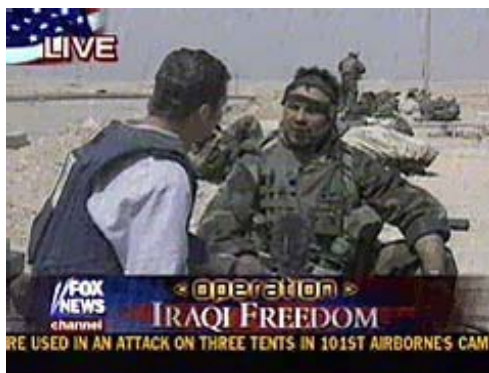
Figure 1: FOX News Channel.

The first, a screenshot from a FOX News report on March 23, 2006, incorporates the American flag in three distinctive ways. First, there is a flag in the upper-left hand corner of the screen which, as it exist on television, waves continuously. Second, the FOX News logo in the bottom left-hand corner is stamped in red, white, and blue directly identifying the network as essentially American. Third, the banner at the bottom of the screen also utilizes the red, white, blue imagery to identify the Pentagon’s codename for the Iraq invasion: “Operation: Iraqi Freedom.”