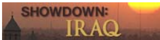
Figure 3: CNN.com.

Networks especially emphasized the conflict inherent in warfare by using an ever-changing rotation of on-screen graphics incorporating Iraqi leader Saddam Hussein in the crosshairs of a weapon, or even an image of Iraq itself in the crosshairs. CNN, for example, soon placed its television and Internet coverage of Iraq under the rubric “Showdown: Iraq,” as seen in web site banner below: 35