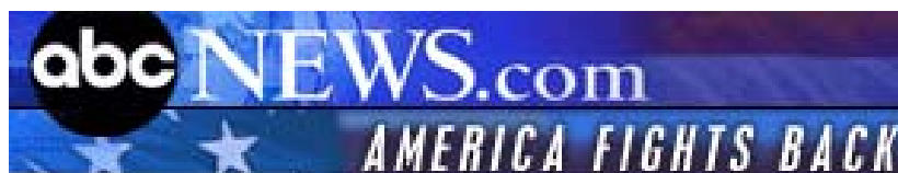
Figure 7: ABCnews.com.

The Oklahoma bombing, as it turned out, was perpetrated by a white American apparently angry with the federal government over a number of issues. But the speculation of Arab involvement comes on a tide of American suspicion about Arab culture and motives which, in American cinema, can be dated as far back as the 1921 orientalist film The Sheik . And this trend continued through September 11, 2001, when the media characterized President Bush as leading the country in a revenge scenario of justifiable American retaliation. Take for instance the following banner from a major news web site during the period when the U.S. invaded Afghanistan: