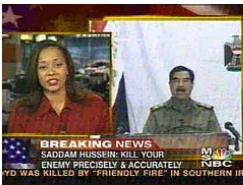
Figure 2: MSNBC.

Networks especially emphasized the conflict inherent in warfare by using an ever-changing rotation of on-screen graphics incorporating Iraqi leader Saddam Hussein in the crosshairs of a weapon, or even an image of Iraq itself in the crosshairs. CNN, for example, soon placed its television and Internet coverage of Iraq under the rubric “Showdown: Iraq,” as seen in web site banner below: 35