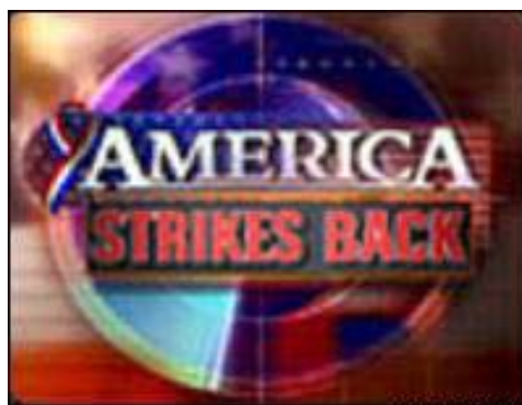
Figure 8: MSNBC.

The 24-hour news networks were bolder in their narrativization of post-9/11 retaliation and followed a cinematic narrative style that would remain influential as the Iraq War drew closer. As seen below, MSNBC (top left), CNN (top right), and FOX News outlets made similar decisions and even went so far as to allude to the culturally iconic 1980 film Star Wars: The Empire Strikes Back :