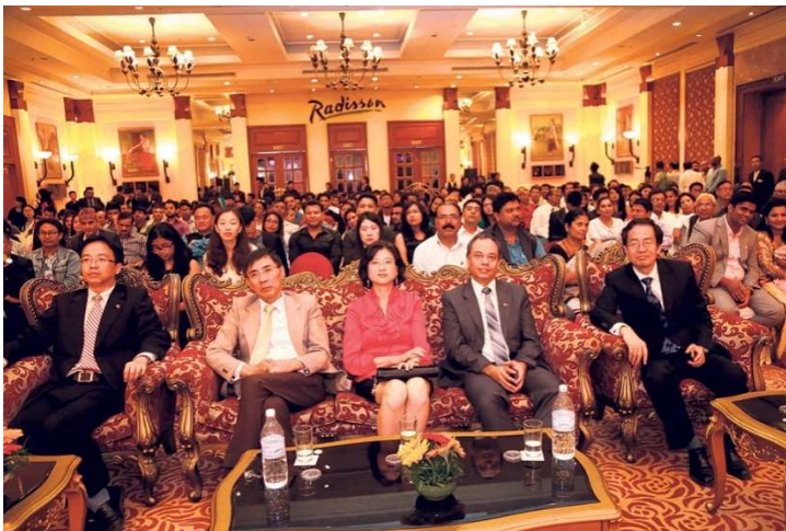
Figure 3. Awards to Chinese scholarship recipients (2017, August 28)

The extent of importance given by the Chinese ambassador to a president of an alumni association can be shown from the photograph below at an awarding ceremony of the Chinese government scholarship where the president is seated in the front row, next to the ambassador. Such gestures are apparently intended to build up goodwill for China.