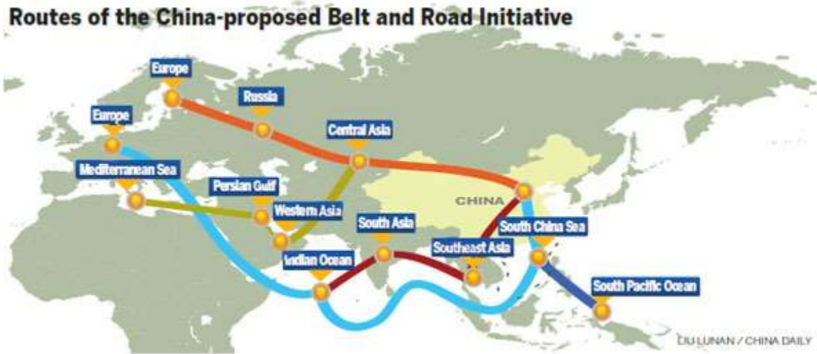
Figure 4. China’s BRI Program (Jia, 2015)

and Martel (2017) describe it as a “super-highway for Chinese economic dominance”; they write, “[It] is China’s plan to dominate world trade by building and controlling a network of roads, pipelines, railways, ports, and power plants to deliver raw materials to China and finished goods to the rest of the world” (para.5). In May 2017, Nepal signed a Memorandum of understanding (MoU) with China, agreeing to join the BRI.