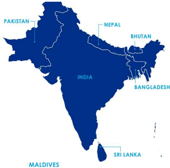
Figure 1. Map of South Asia (International Mission Board, 2016)

South Asia, with a population of 1.67 billion, is constituted of seven countries — Bangladesh, Bhutan, India, Nepal, Pakistan, Maldives and Sri Lanka 1 — the last two of which are littoral states. India is the largest among them by size, population and economy.