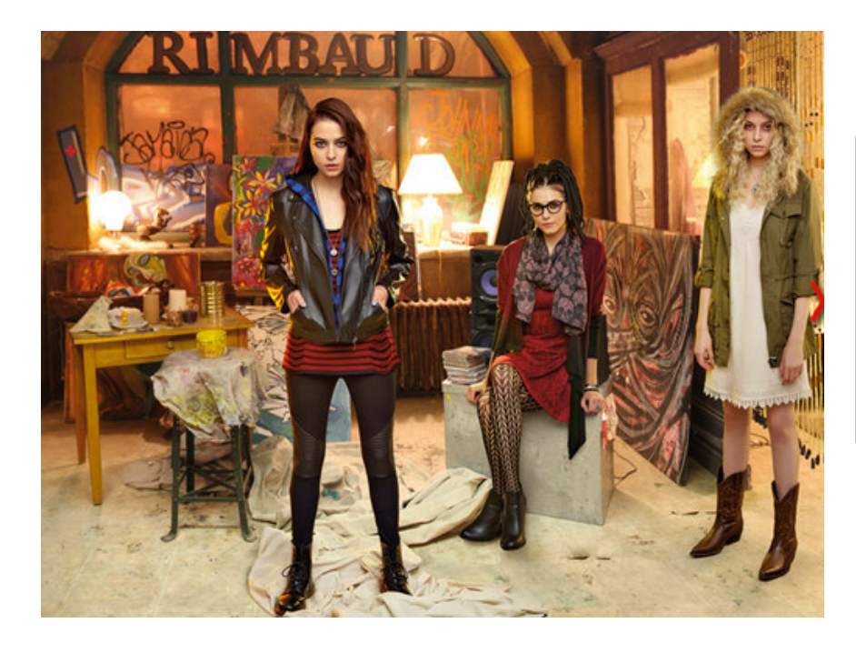
Fig. 8 – An advertisement for the Hot Topic Orphan Black clothing line. The Sarah, Cosima, and Helena outfits.

an official tie-in clothing line to accompany the release of Orphan Black 's third season. Hot Topic is an American retail chain that specializes in "alternative culture-related clothing and accessories," and their customer base is adolescent to young adult girls and boys ("Hot Topic").