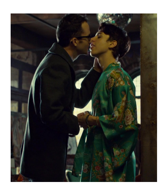
Fig. 3 – Felix (right) in his "open shorty kimonos" in "Conditions of Existence"