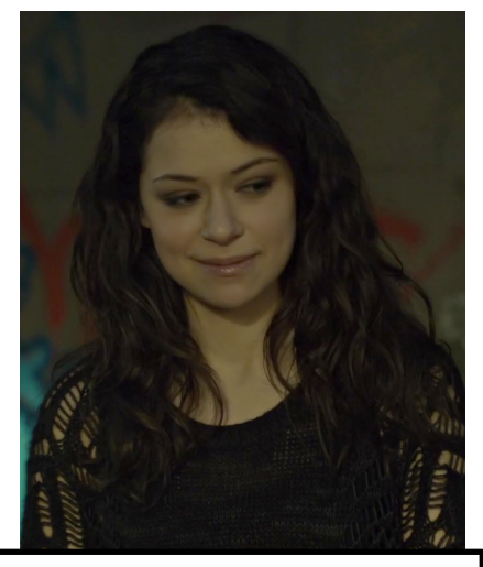
Fig. 1 – Still of Sarah from "Variable and Full of Perturbation"