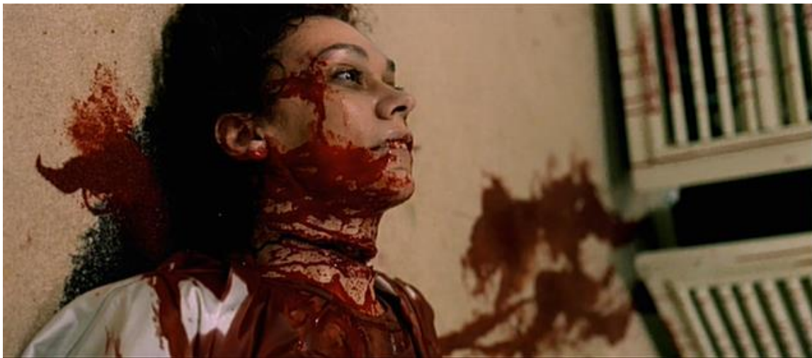
Figure 2: Mother's body after the Killer's attack. Marie has not yet emerged from her hiding space in the closet ( High Tension ).