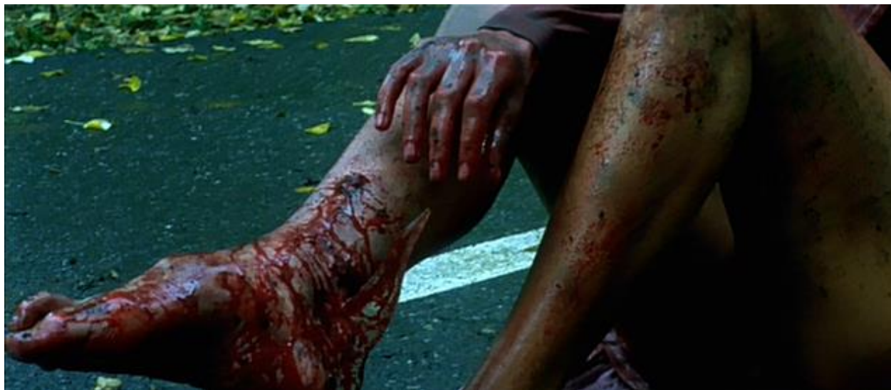
Figure 3: Alex's leg and ankle as she attempts to crawl away from Marie ( High Tension ).