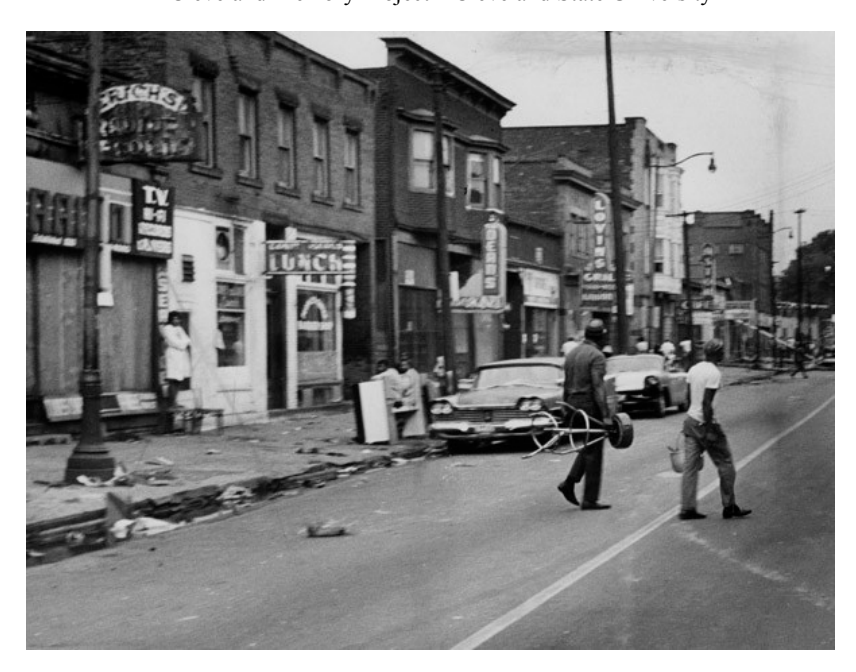
Two men loot Hough businesses during the riots: July 19, 1966

Cleveland Memory Project—Cleveland State University