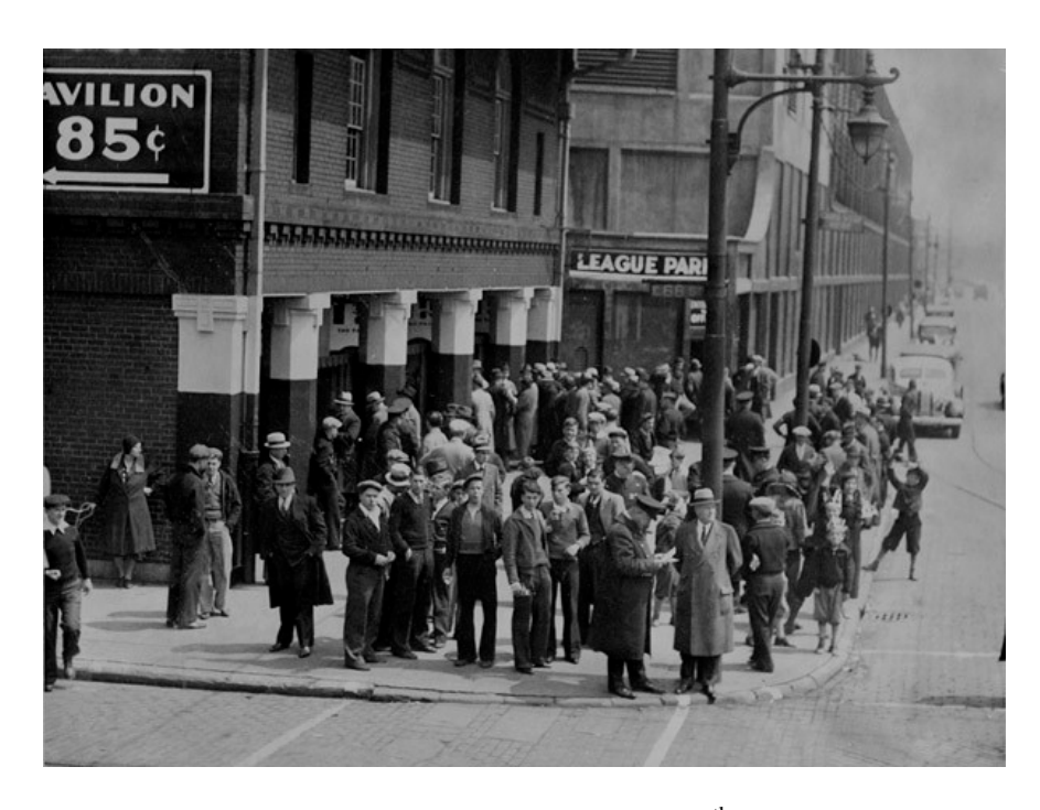
League Park—Baseball at the Corner of East 66<sup>th</sup> and Lexington: 1935

"League Park Ticket Booth and Entrance Areas"