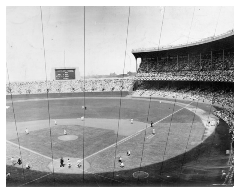
Cleveland Municipal Stadium opens in-front of a crowd of 80,184: July 31, 1932

"The Cleveland Indians play the Philadelphia Athletics at the first-ever baseball game at Cleveland Municipal Stadium"