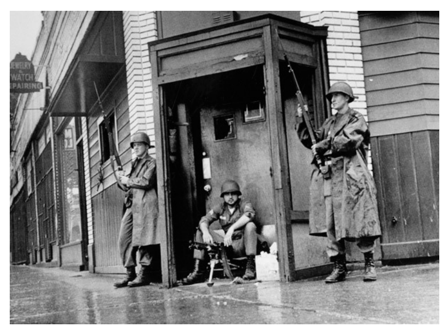
National Guardsmen keep guard during the Hough Riots: July 24, 1966

"Ohio National Guard members take cover from the rain"