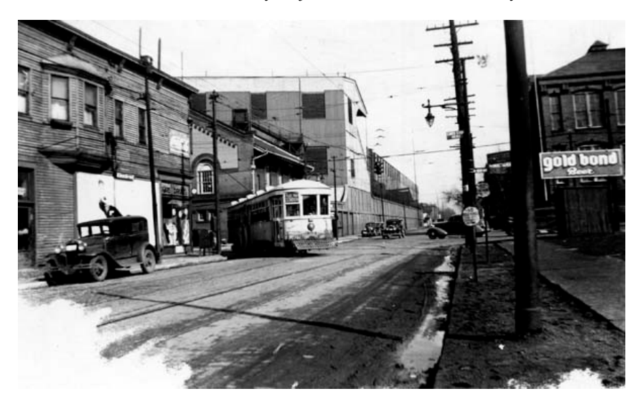
A Cleveland railway or streetcar leaves League Park: Date Unknown

Cleveland Memory Project—Cleveland State University