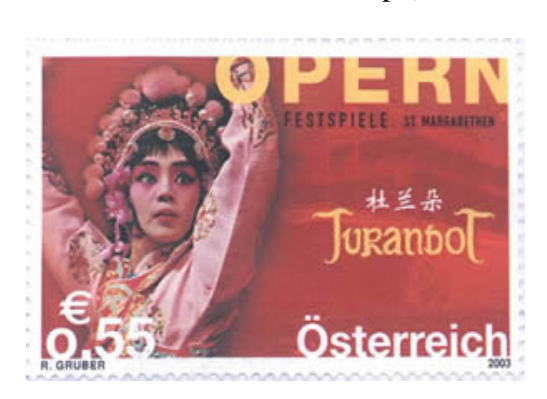
Illustration 2: Commemorative Stamp (2003, Austria)<sup>118</sup>

This production was widely acclaimed both in China and abroad. Not only was it chosen as a cultural exchange event for embassies from 108 countries in China in 2004, it also received international invitations from countries such as Poland, Hungary, and Romania. The Austria Postal administration also released a commemorative stamp for this adaptation in 2003 (see Illustration 2). 117