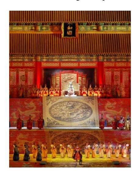
Illustration 5: The Dragon-depicted Fabric 151

Zhang aimed to put Turandot into its historical context. During imperial days, the hairpin was the only sharp object that Chinese courtiers were allowed to carry. Thus, Zhang used a hairpin as Liú's suicide weapon. Moreover, because the Forbidden City was built during the Ming Dynasty, Zhang's costumes are remade in the Ming style. For the same reason, a drum corps is added at the beginning, which follows the Ming dynasty tradition of using drums to announce the emperor's arrival or a royal celebration (See Illustration 7).<sup>150</sup>