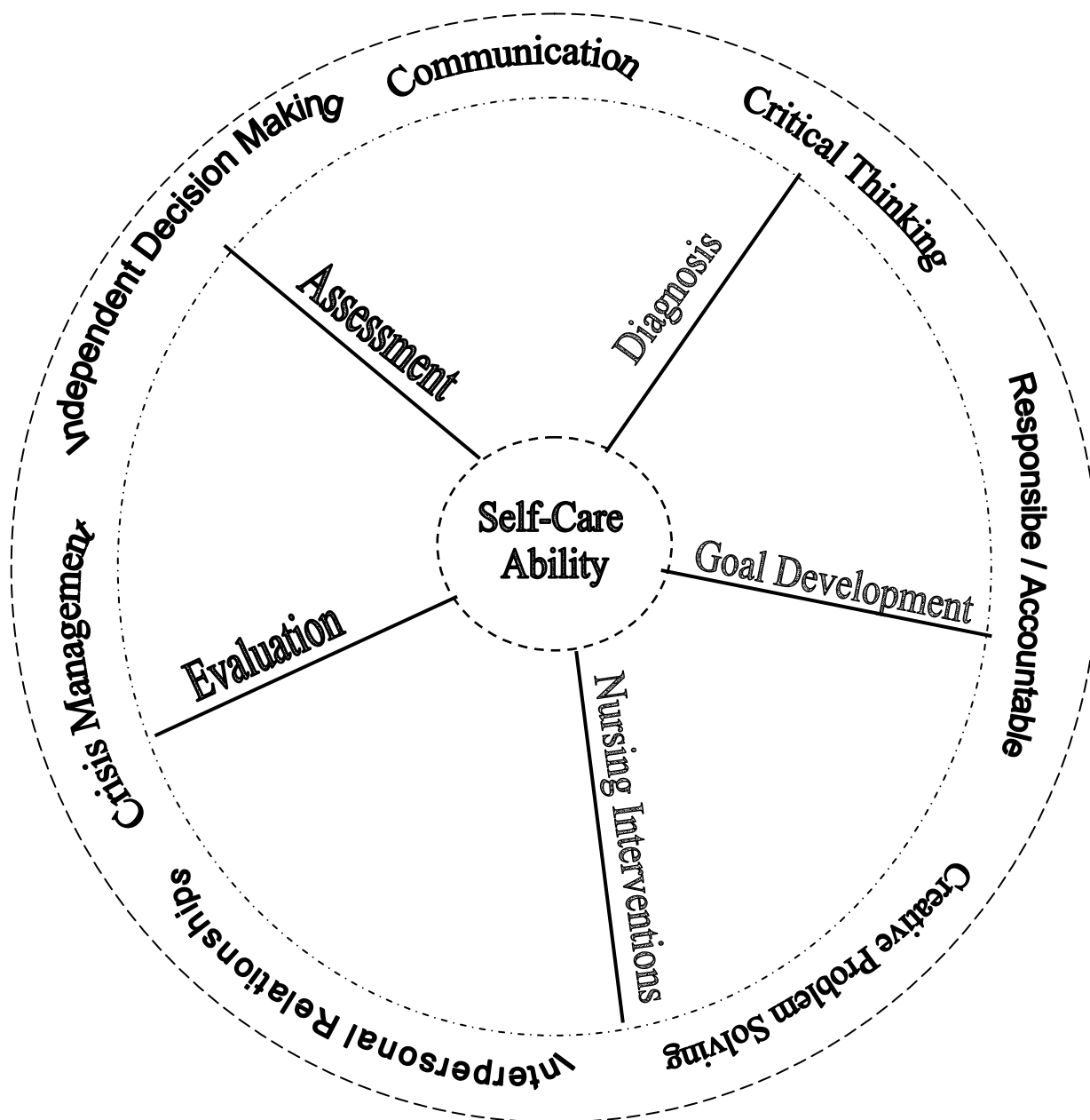
Figure 1. Nursing Leadership Conceptual Framework.

Nursing Leadership Conceptual Framework demonstrating the communication and flexibility between the nursing leadership behaviors, reflected in the outer rings, the nursing process, reflected on the spokes and the ultimate goal of self-care ability.